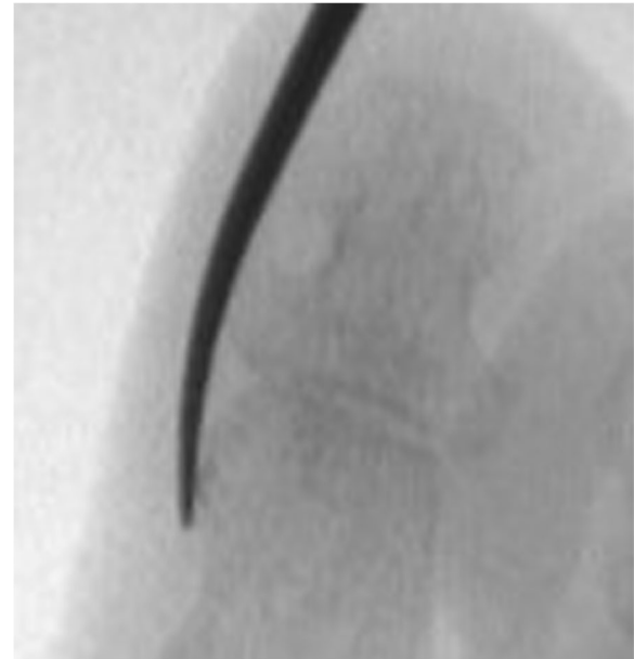
Fig. 3 A blunt elevator for separating adhesions and periosteal elevation

prominence to be resected to enable an adequate range of motion to perform the condylectomy. By contrast, White [15] proposed a longitudinal plantar incision in the sagittal plane over the bony prominence and lateral to the flexor tendon. This approach might compromise the plantar digital neurovascular bundle because, as we indicated, one part is located on the sides of the plantar aspect. Hymes [16] proposed a longitudinal dorsal incision to the sagittal plane over the bony prominence, lateral to the extensor tendon and proximal to the bony area to be resected. However, this approach can compromise the dorsal digital neurovascular bundle.