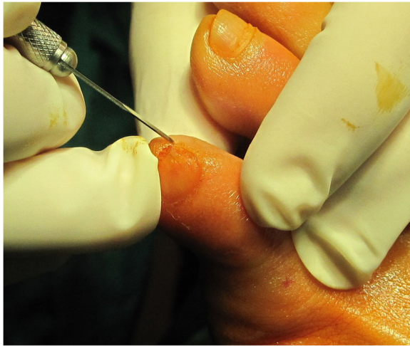
Fig. 1 Incision to the distal pulp of the toe

used intraoperative control element of the surgical technique because of its low emission of radiation compared with conventional X-rays.