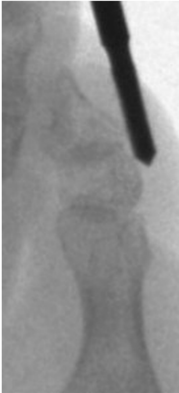
Fig. 4 Location of the Shannon-Isham burr

longitudinal dorsal incision along the sagittal plane, lateral to the extensor tendon, and proximal to the head of the proximal phalanx; however, this pathway can also compromise the dorsal digital neurovascular bundle.