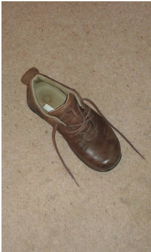
Fig. 2 Nigell's shoe

great grandmother in her eighties who was very resistant to attempts by podiatrists to encourage her to wear more supportive shoes: