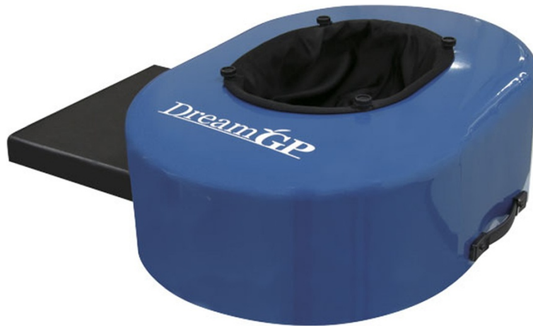
Fig. 1 3D foot scanner, Footstep PRO by Dream GP Company, Osaka, Japan

easily reach without needing to raise or lower their arms too much. The participants looked straight ahead and stood as still as possible.