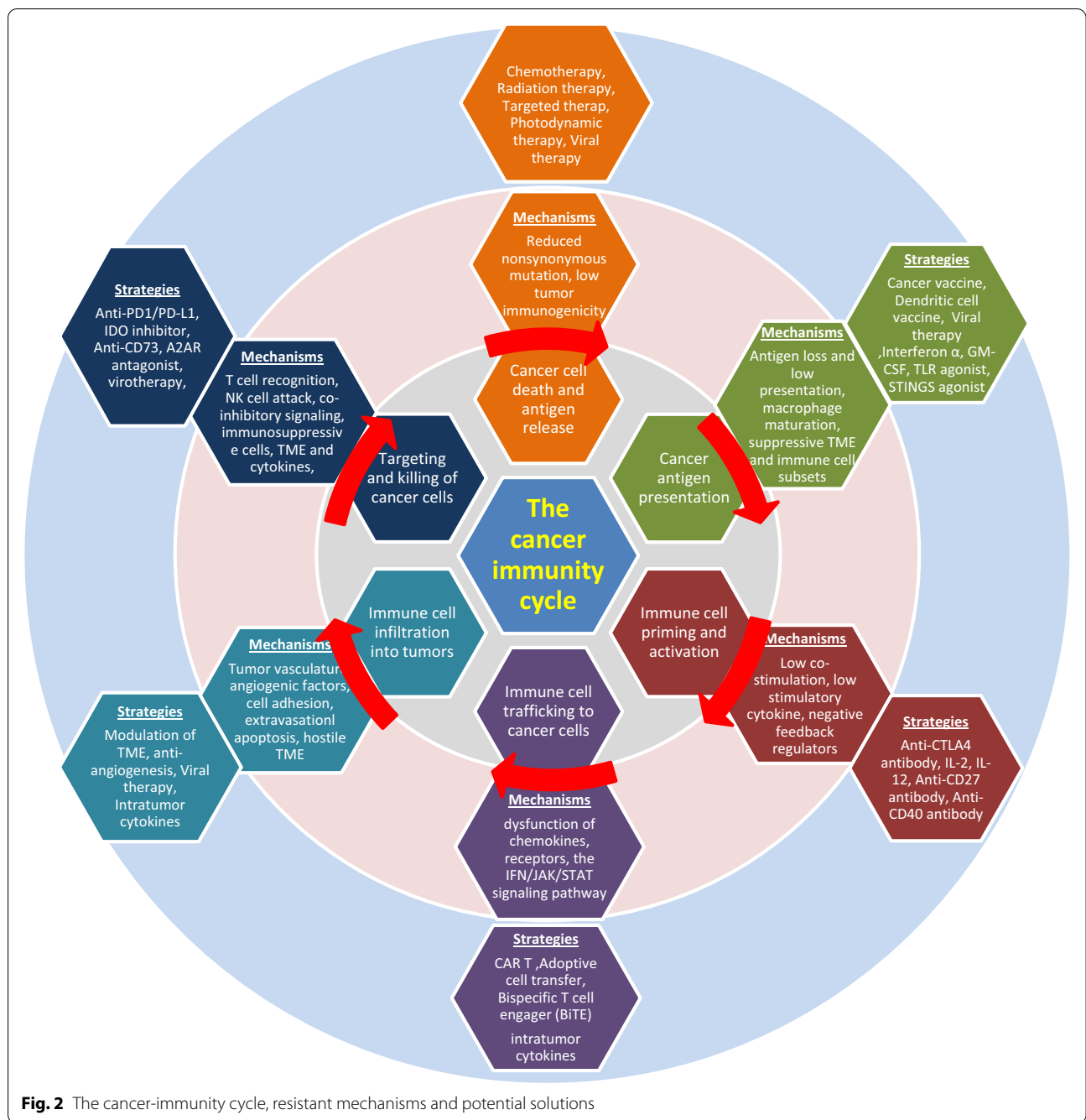
Fig. 2 The cancer-immunity cycle, resistant mechanisms and potential solutions

anthracyclines [21]. To date, multiple studies have demonstrated the contribution of cytotoxic chemotherapy to anti-cancer immunity, leading to several FDA-approved combination therapies with immunotherapy (Table 2) [22].