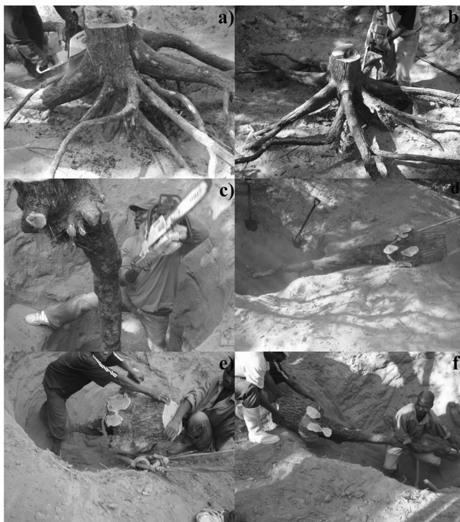
Figure 3 Separation of lateral roots from the root collar/taproot (a, b, c), and removal of the taproot including the root collar and the stump (d, e, f).