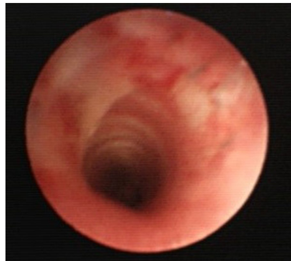
Fig. 4 Tracheal anastomosis confirmed by bronchoscopy on postoperative day 3

Airway trauma is a life-threatening condition that may result from blunt and penetrating neck injuries. Delayed diagnosis and treatment lead to early fatal outcomes or late sequelae, such as airway stenosis. Therefore, prompt and accurate diagnosis is mandatory for the survival of these patients. The symptoms and signs of tracheal injury depend on the site and severity of the injury; most symptoms are not specific to this type of injury. Subcutaneous emphysema is the most common finding. Other symptoms such as dyspnea, tachypnea, respiratory distress, and hemoptysis have also been observed. Additionally, air escape from penetrating neck trauma should be considered a diagnostic tool for airway injury [2].