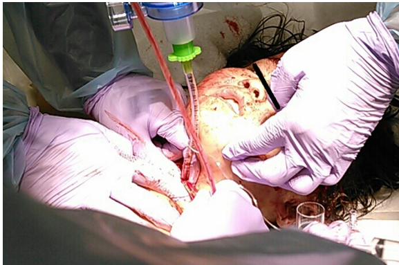
Fig. 1 A 4 mm tracheal tube inserted directly into the trachea through the neck wound

lumen was felt and confirmed with a finger, and a 4-mm tracheal tube was inserted directly from the cervical wound (Fig. 1).