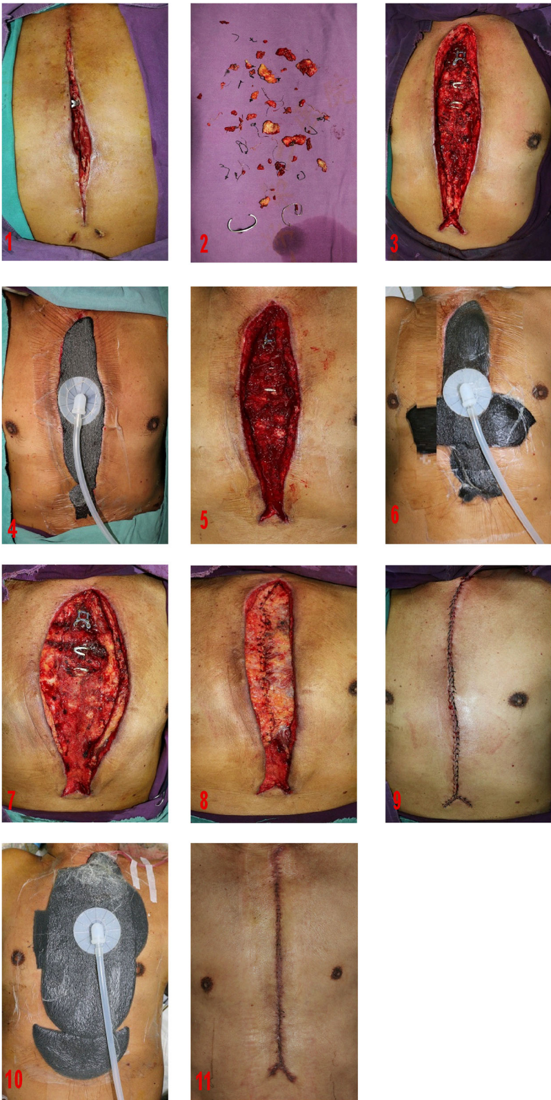
Fig. 3 (See legend on next page.)