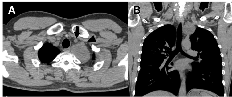
Fig. 2 Axial (a) and coronal (b) views of the chest computed tomogram. The tumor was adjacent to the left common carotid (arrow) and left subclavian (arrowhead) arteries

desirable. For small tumors, resection can be performed with simple VATS or VATS with carbon dioxide insufflation into the thoracic cavity, or, in some cases, robotic surgery; however, when tumors are large and adjacent to major vessel or nerves, it is often difficult to dissect the cranial part safely because of anatomical issues, surgical device issues in VATS, and poor visualization. In these cases, an additional neck approach is necessary for safety.