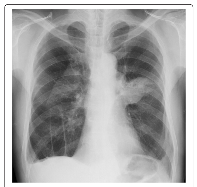
Fig. 1 A chest X-ray revealed a mass shadow in the left lung field and a positive silhouette sign for the left second arch

but did not invade it, we could detach the visceral pleura of the left upper lobe from the aortic arch aneurysm. We performed left upper lobectomy. After that, we confirmed that the aneurysm was proximal to the left subclavian artery. Because of the position of the TAA, it was difficult to perform patch angioplasty. We decided to perform aortic arch replacement for the aortic arch aneurysm with a 3-branched artificial vessel under