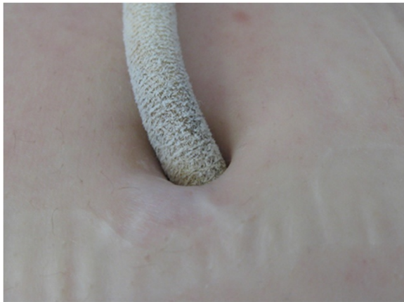
Fig. 1 The driveline exit site in patient 1 after 7.5 years of support

device pump speed is maintained at 9400 to 9600 RPM and the estimated pump flow is approximately 5.0 L/min. Phenprocoumon (Coumarin) dose is adjusted to achieve an international normalized ratio (INR) of approximately 2.5, and the patient takes 75 mg clopidogrel daily. There have been no problems related to LVAD equipment maintenance. The driveline exit site has been free from infection for the duration of his circulatory support (Fig. 1). This patient has decided to not undergo heart transplant, he exercises at a gym twice a week and works as an office supervisor, and support continues 7.63 years after implantation.