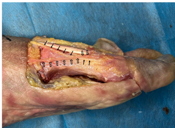
Fig. 1 Exposure of DMCN and sentinel vein: Solid arrows show the course of DMCN, and hollow arrows show the course of sentinel vein

In the lateral view, the height of the first metatarsal base was measured using a vernier caliper and recorded as H1. Additionally, the height of the middle part of the first metatarsal (H2) was measured in the same manner. In this view, the distances from the inferior edge of the DMCN to the uppermost part of the base and middle