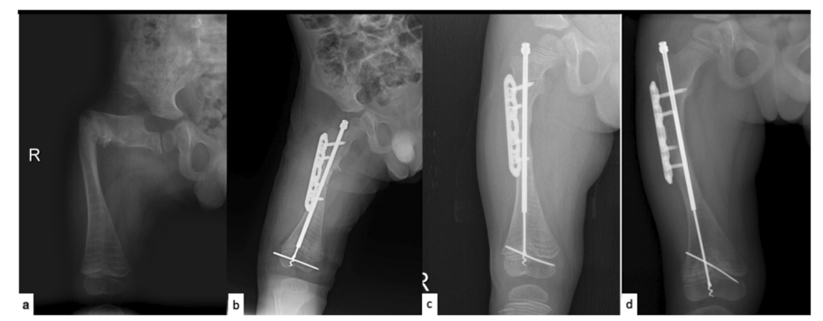
Fig. 2 Patient with intramedullary fixation combined with plate and screws a preoperative radiograph, b postoperative first-day radiograph, c second-year follow-up radiograph, d third-year follow-up radiograph