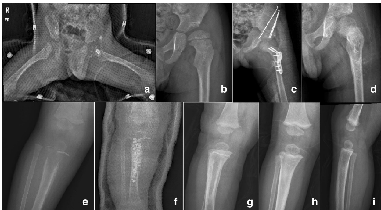
Fig. 2 AHO with or without a secondary septic arthritis. a An 11-month-old boy, who suffered from osteomyelitis concurred with septic arthritis on the left proximal femur, had received debridement combined with RBGS mixed with antibiotics. The hip was immobilized with a brace postoperatively. b Pathological subluxation was observed after 3 years postoperatively. c An innominate osteotomy and varus derotational osteotomy of the proximal femur were performed to correct residual deformities d A limb shortening of 1 cm was noted at the final follow-up. e A 9-month-old boy who suffered from osteomyelitis on the right proximal tibia. f After being debrided, bone defect was filled with RBGS, which was mixed with 0.5 g vancomycin. The affected limb was immobilized by a cast postoperatively. g The bone lesion healed after 2 months postoperatively. h, i The outcome of the involved limb was good at the final follow-up

In the current study, RBGS mixed with antibiotics were implanted in the local defect after debridement. There are multiple benefits to this technique. The local delivery allows for a slow-release effect and can maintain a relatively higher antibiotic concentration locally. Local use of antibiotics has previously been shown to improve local concentrations. The use of tobramycin had local concentrations of about 1000 times above the minimal inhibitory concentration (MIC) for most strains of Staphylococcus [31]. Gentamicin-PMMA beads also showed high local concentrations, around 100 times above the MIC, and remained bactericidal several days later [32]. Local sustained availability of drugs is more effective in achieving prophylactic and therapeutic outcomes. It could also help to avoid high systemic levels of parenteral antibiotics which can lead to additional adverse effects, such as toxic liver injury and fungal