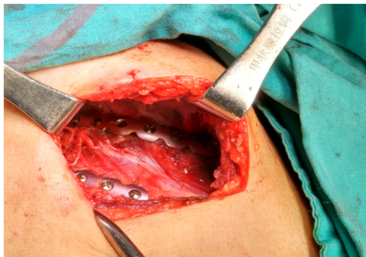
Fig. 5 The incision for minimally invasive chest wall stabilization

From June 2019 through September 2019, nonintubated minimally invasive CWS was performed in 20 patients with multiple rib fractures. The characteristics of these patients are reported in Table 1. Among these patients, the mean age was 59.7 years, and 12 patients (60%) were men. CWS was mostly performed for lateral rib fractures in this study ( n = 8 ). SpO 2 , PaCO 2 , BP, HR, vital volume, and breathing rate were all maintained at normal levels before the operation. The mean pain score was 4.2 points before the operation. The intraoperative results are listed in Table 2. The mean operation time was 92.5 min, and the mean blood loss was 49 ml. No patient required conversion to tracheal intubation. SpO 2 , PaCO 2 , BP, HR, vital volume, and breathing rate were also maintained at normal levels during the operation. The postoperative results are listed in Table 3. The mean extubation time of the laryngeal mask was 8.9 min, the mean postoperative fasting time was 6.1 h, and the mean postoperative hospital stay was 6.2 days. Intercostal drainage was needed in only 7 patients, and the mean amount of postoperative drainage was 97.5 ml. Only one patient developed a pulmonary infection after the operation. The mean postoperative pain score was 2.9 points at 6 h, 2.8 points at 12 h, and 3.0 points at 24 h. The mean PONV score was 1.9 points at 6 h, 1.8 points at 12 h, and 1.7 points at 24 h.