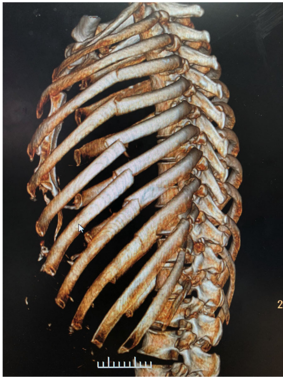
Fig. 4 Chest computed tomography and three-dimensional reconstruction of the ribs

12 h, and 24 h after the operation and postoperative nausea and vomiting (PONV) scores 12 h, 24 h, and 48 h after the operation. All operative and postoperative complications, including anesthesia-related complications, were recorded in this study.