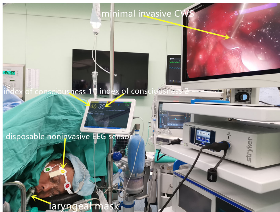
Fig. 3 Operative views of a patient undergoing nonintubated minimally invasive chest wall stabilization

We recorded the following baseline characteristics: sex, age, and side, location and number of fractures. \text{SPO}_2 , \text{PaO}_2 , \text{PaCO}_2 , blood pressure (BP), heart rate (HR), vital volume, and breathing rate were recorded at the following time points: preoperatively, intraoperatively, and postoperatively. Operation time, blood loss, and dosage of opioid and vasoactive drugs were recorded during anesthesia. The time of extubation after the operation was also recorded. The visual analog scale (VAS) was used to evaluate pain scores 6 h,