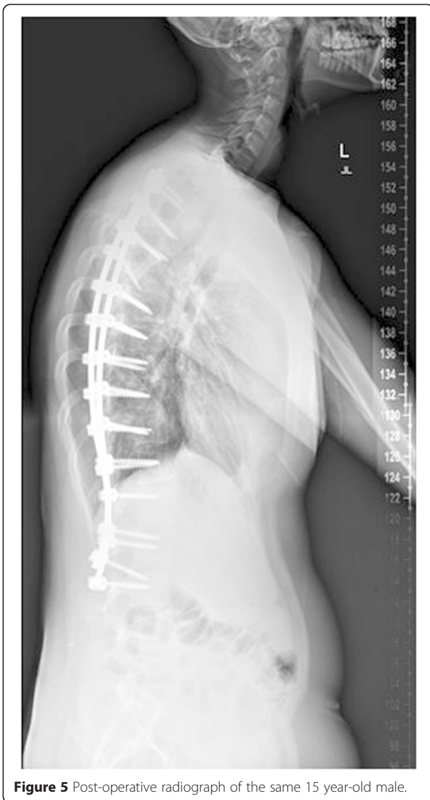
Figure 5 Post-operative radiograph of the same 15 year-old male.

example, 6 studies were included on Marfan syndrome comprising 139 surgical patients. Only 4 of these studies reported on dural tears and therefore the reference population for dural tears is 93 instead of 139.