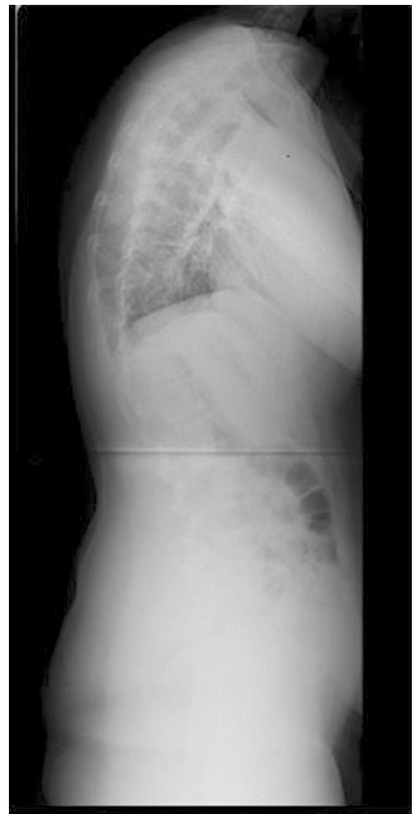
Figure 2 Pre-operative radiograph of 15 year-old male with Marfan syndrome.