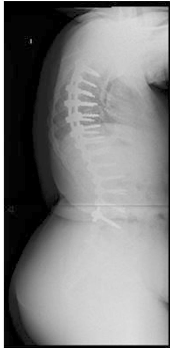
Figure 17 Post-operative image of the same patient.

patients operated on at most institutions, this population's data provides an excellent tool for comparison (Table 10).