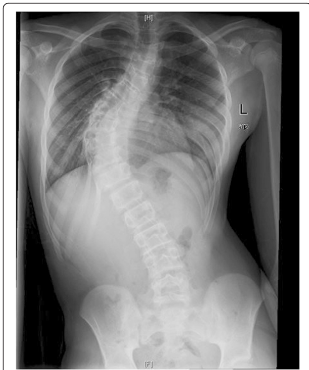
Figure 10 Preoperative radiograph of 12 year-old female with NF.

Wilde et al in 1994 studied 25 patients, reporting wound infections in 24% of patients, 33% of these infections required return to the operating room for surgical debridement. The authors highlighted the worsening of curves postoperatively in some patients undergoing surgical correction, even in those with solid arthrodesis [22]. Halmi et al. [19] stressed the importance of early detection and intervention, given the rapidly progressive nature of the deformity. The authors noted one case of paraplegia