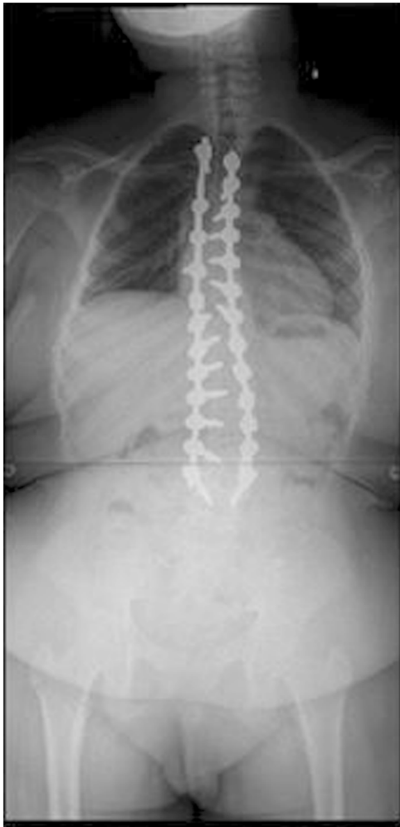
Figure 16 Post-operative image of the same patient.