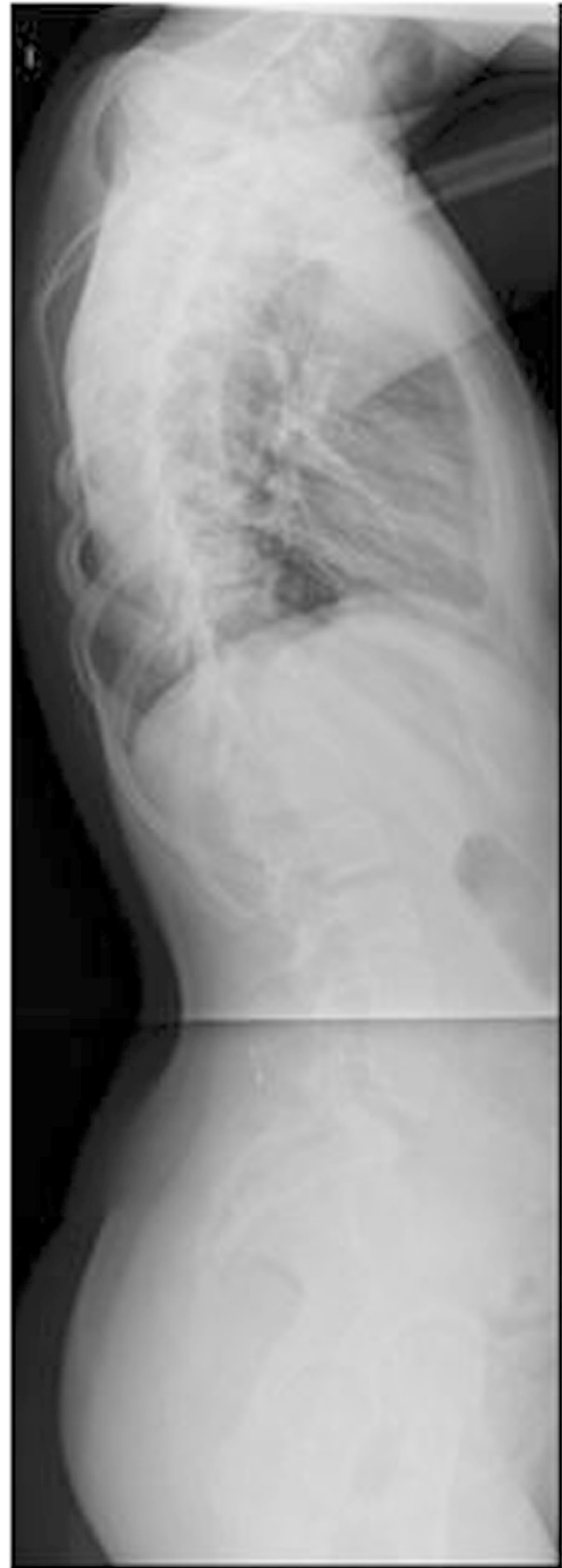
Figure 7 Preoperative radiograph of 12 year-old female with Down syndrome.