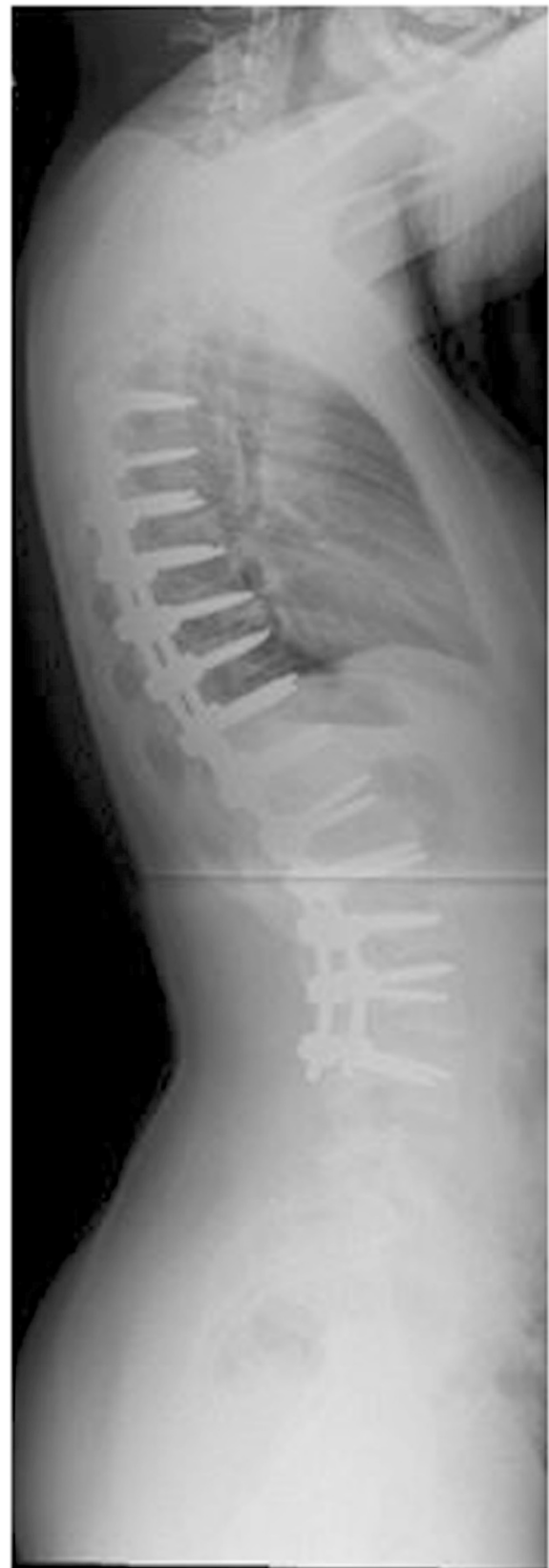
Figure 9 Post-operative image of the same patient at our institution.