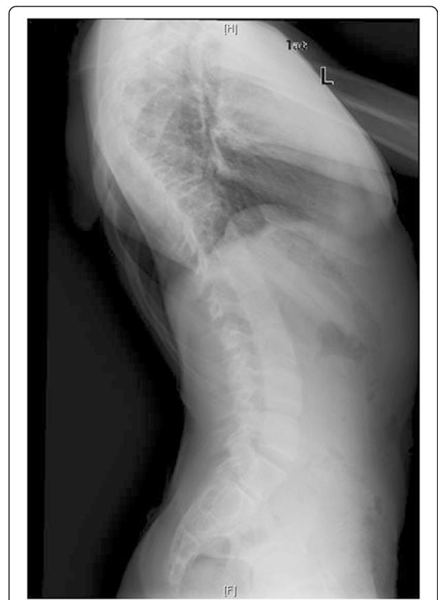
Figure 11 Preoperative radiograph of 12 year-old female with NF.