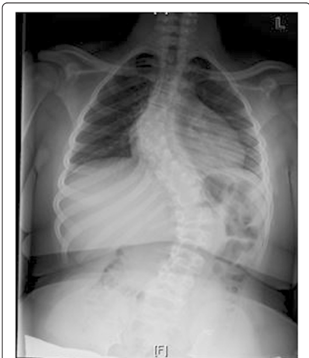
Figure 14 Preoperative radiograph of a 14 year old with Prader-Willi syndrome.

Syndromic scoliosis represents a wide range of underlying pathologies and phenotypic manifestations. This paper is a thorough analysis of the recent literature concerning the quantitative and qualitative complication rates associated with these challenging patients. To provide a reference point for our data, a comparison population is necessary. Adolescent Idiopathic Scoliosis (AIS) is the most studied and published-upon category of scoliosis. Furthermore, given the high rate of AIS