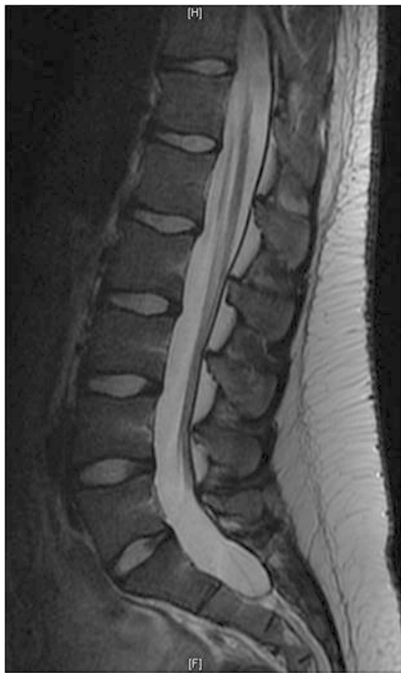
Figure 3 Pre-operative MRI of a representative patient with Marfan syndrome.

For each syndrome reviewed, summary tables have been compiled. These tables document collective rates of dural tears, wound infections, respiratory issues, neurological compromises, hardware failure, pseudarthrosis, and average blood loss in mL because these were the most consistently reported complications. Because not every study reported on every complication, complication rates are reported in both percentage and absolute values to indicate the variable denominator for each complication. As an