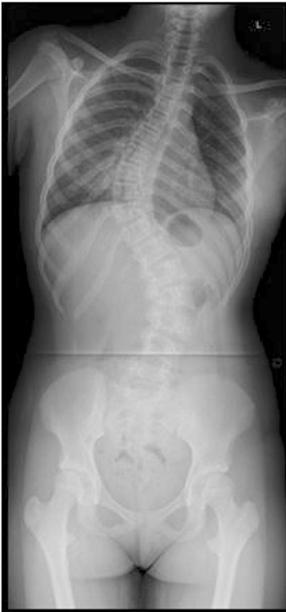
Figure 6 Preoperative radiograph of 12 year-old female with Down syndrome.

In 2012, Gjolaj et al compared 34 cases of spinal fusion in Marfan patients to age matched AIS controls and did not find a significant difference in estimated blood loss (EBL). While this differed from the findings of other articles, EBL still averaged 1700 mL for these cases. Of the 9 reoperations noted, 2 were due to the need for proximal extension secondary to curve progression. The authors stressed the importance of longer fusions, greater attention to sagittal balance, and the risk of hardware failure and reoperations (11.8% of patients) [7].