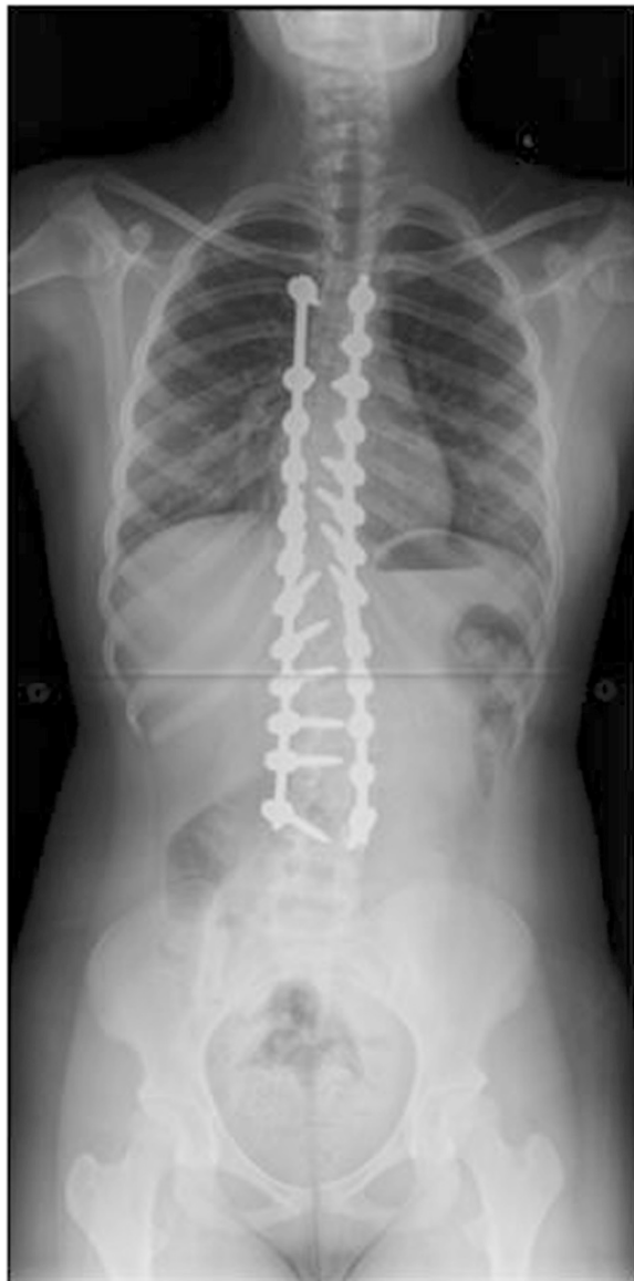
Figure 8 Post-operative image of the same patient at our institution.

Down Syndrome is the most common chromosomal abnormality in the US, and most frequent cause of mental retardation. It stems from trisomy of the 21 st