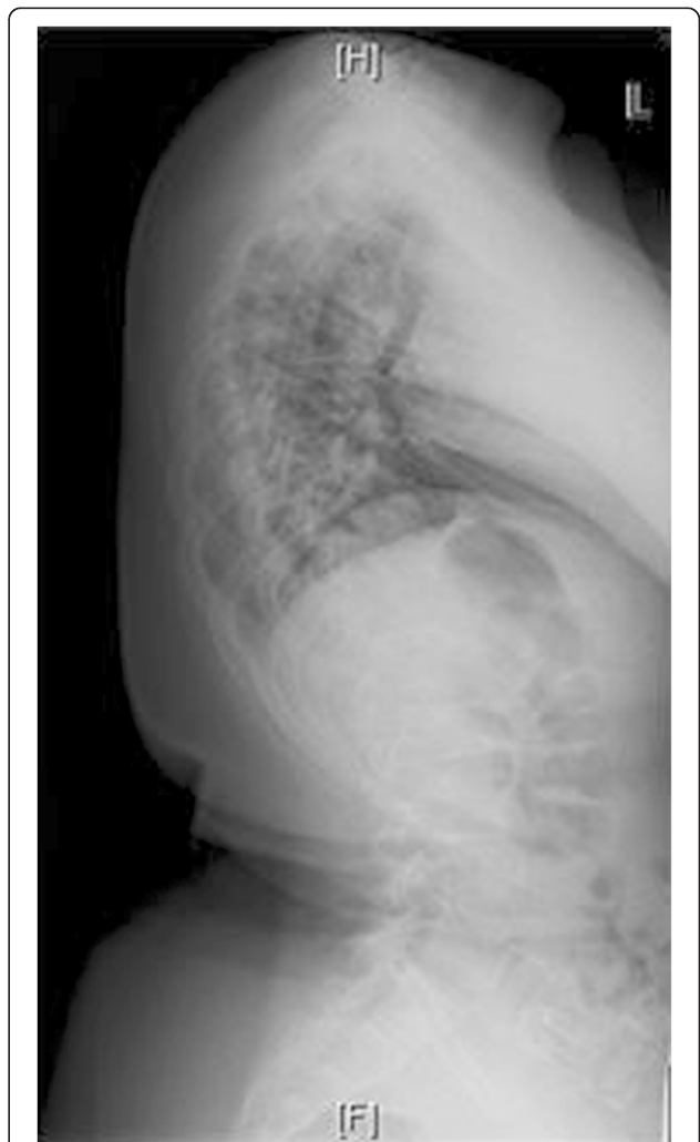
Figure 15 Preoperative radiograph of a 14 year old with Prader-Willi syndrome.