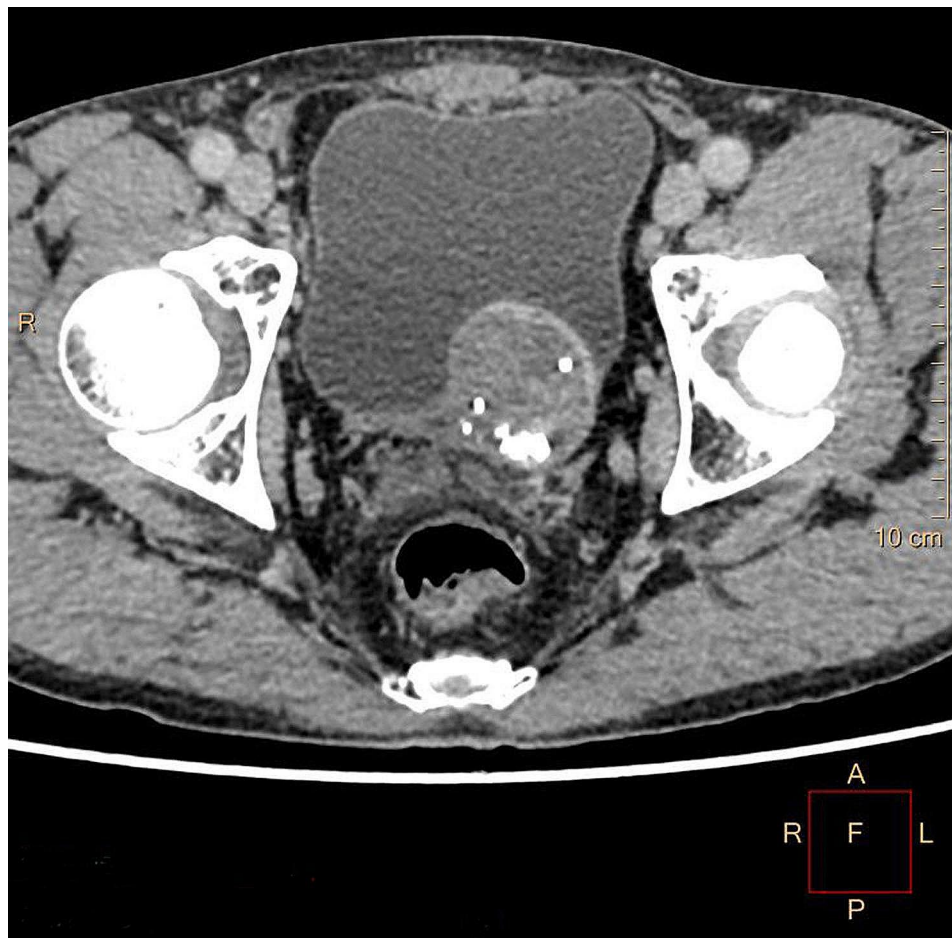
Fig. 1 Contrast-enhanced axial CT revealed a 4.5×4.3×4.0-cm soft tissue mass located in the left posterior wall of the bladder with a clear boundary and uneven density protruding into the bladder cavity

to 14 cm with a mean size of 3.25 cm. Of note, tumours that occurred in areas such as the orbit and the eyelid often had a smaller diameter than tumours that occurred in subcutaneous soft tissue and deep organs. Although larger tumor diameters are positively correlated with higher risk stratification according to the risk assessment criteria, Feasel et al. demonstrated that 26 cases of SFTs occurring in cutaneous/subcutaneous soft tissue showed no recurrence or metastasis, and 2 cases of histologically malignant SFT were included [8].