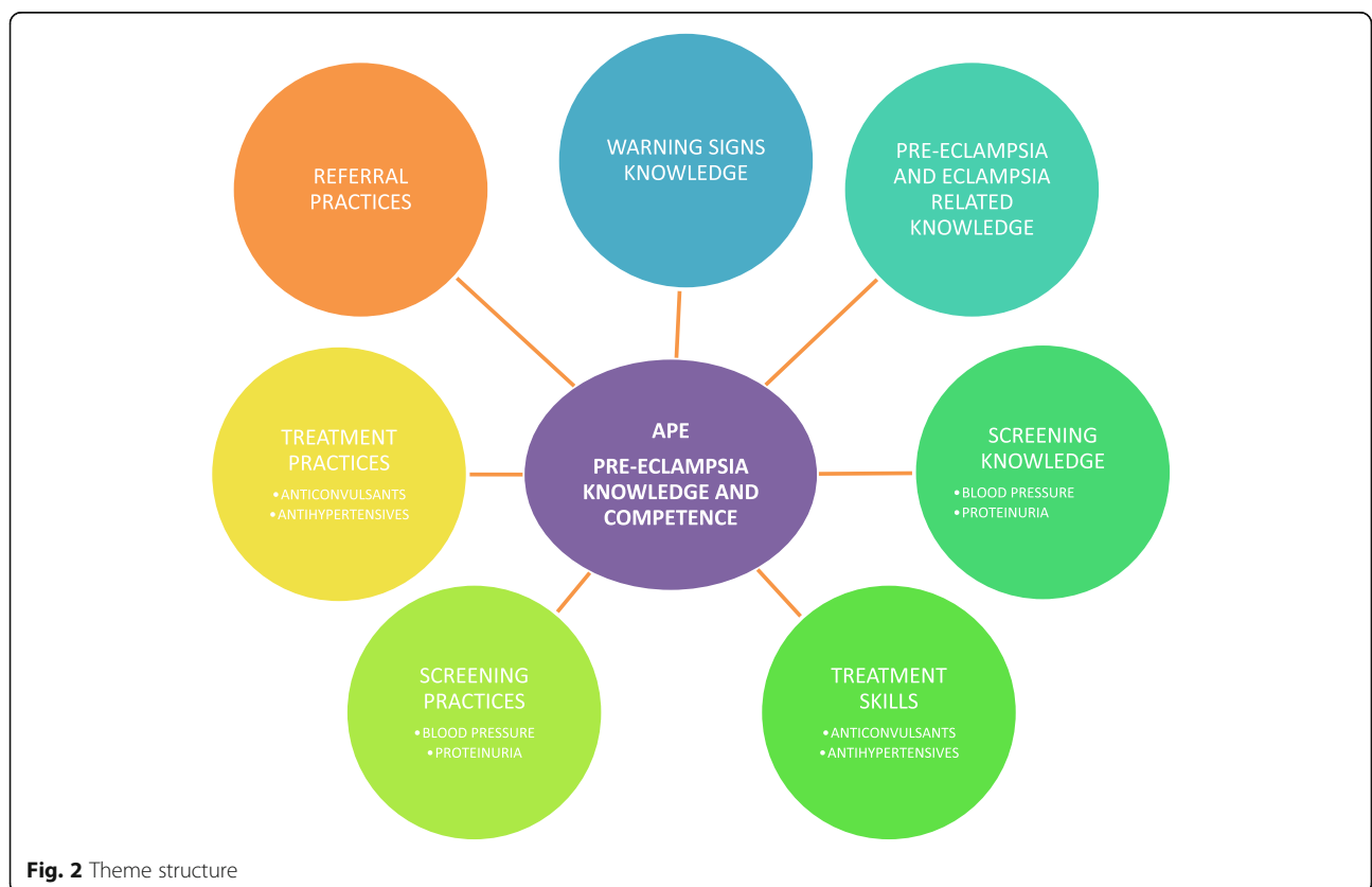
Fig. 2 Theme structure

To allow the two teams to work independently, the data was split into two Nvivo projects, but the same coding structure was used for both teams. Coding consensus meetings to discussing data analysis strategy and findings were held via Skype™. Coding agreement