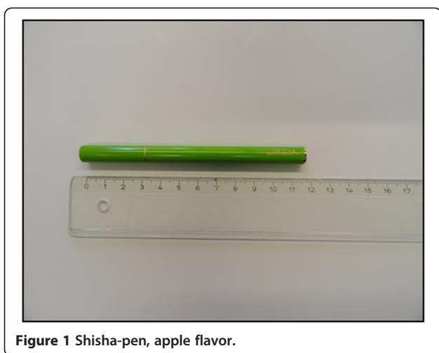
Figure 1 Shisha-pen, apple flavor.

the gauze is evaporated. A dismantled shisha-pen is shown in Figure 2.