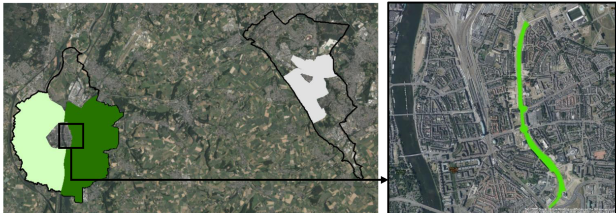
Fig. 1 Area-based exposure groups and Green Carpet Area. Left: no exposure (white), minimal exposure (light green) and maximal exposure (dark green) areas in Maastricht and Heerlen. Right: 2.3 km Green Carpet on top of the A2 highway tunnel.

Green Carpet because they lived approximately 25 kilometers away from the Green Carpet. Heerlen was selected as comparison area because the selected neighborhoods in this city are comparable to Maastricht with regard to the number of inhabitants, urbanization and the geographical and cultural context.