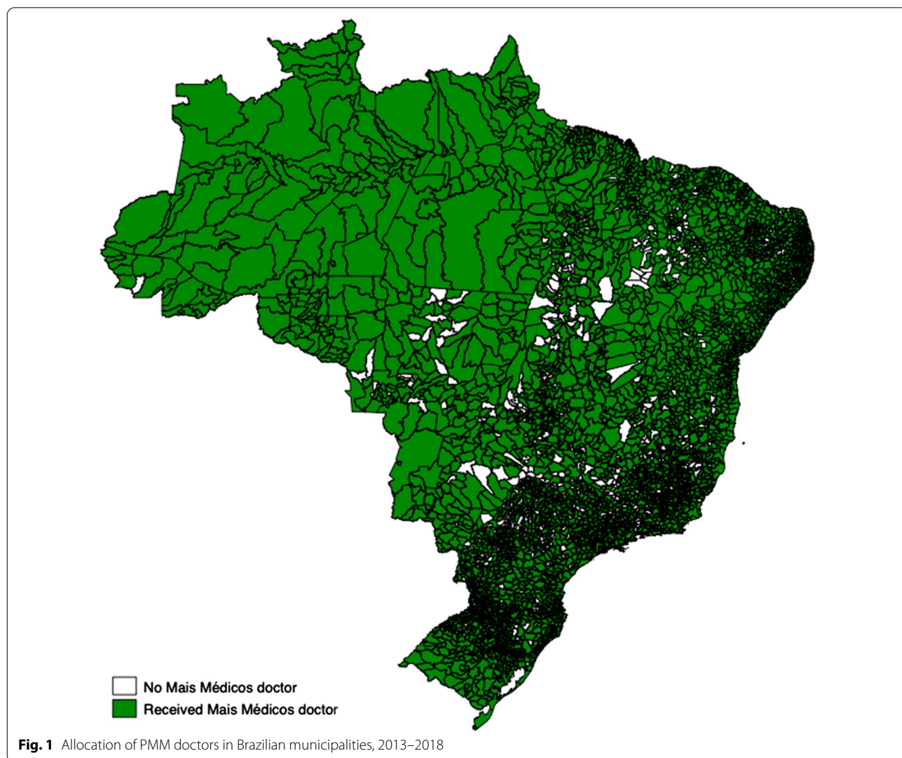
Fig. 1 Allocation of PMM doctors in Brazilian municipalities, 2013–2018

the mean municipal IMR from 16.48 in 2007 to 12.41 in 2018 (24.7% relative decrease), whilst the mean municipal NMR decreased from 11.13 to 8.78 over the same period (21.1% relative decrease) (Table 1; Fig. 2a and b). There was a general improvement in socio-economic characteristics across municipalities during the 12-year period, including an increase in GDP per capita (BRL 9172.81 in 2007 to BRL 23,165.27 in 2018), and an increase in municipal health spending per capita (BRL 270.02 in 2007 to BRL 378.62 in 2018). The means in socio-economic and health service provision characteristics of municipalities were similar for both PMM receiving and non-PMM receiving municipalities (Additional file 1: Appendix S4). Trends in mean rates of IMR and NMR in PMM receiving and non-PMM receiving municipalities between 2007 and 2018 illustrated parallel trends in the periods before PMM introduction (Additional file 1: Appendix S5, S6).