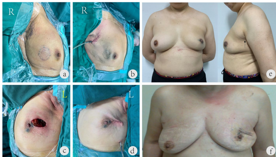
Fig. 2 Images of incisions created during the single-port insufflation endoscopic breast-conserving surgery and conventional breast-conserving surgery. a, b The single-port incision is hidden by the upper limb and axillary fossa. The elegant appearance after the operation is evident from the front and lateral photographs. No scar is observed from the front. The black arrow indicates the hidden single-port scar in the lateral photo. c, d Routine breast-conserving surgery leaves two obvious incisions on the axillary fossa and the breast surface. e A 55-year-old woman with left breast cancer in the upper outer quadrant. The operation method was lumpectomy plus sentinel lymph node biopsy. Postoperative follow-up photographs taken at 12 months are shown. f A 68-year-old woman with left breast cancer in the upper outer quadrant. The operation method was lumpectomy plus sentinel lymph node biopsy. Postoperative follow-up photographs taken at 12 months are shown

conventional surgery [24]; this phenomenon has been reported extensively, and examples of this can be found in gastrointestinal [25], hepatobiliary [26], and thyroid surgeries [27]. However, our clinical care teams do not begrudge the additional time and effort, in light of the benefits to the postoperative well-being of the patients (personal communications). Nonetheless, consideration of the increased operative cost due to the longer time and additional effort (surgeon skills, operative tools, etc.) is necessary, especially in countries where medical care costs fall on the patients or on insurance providers that operate for profit.