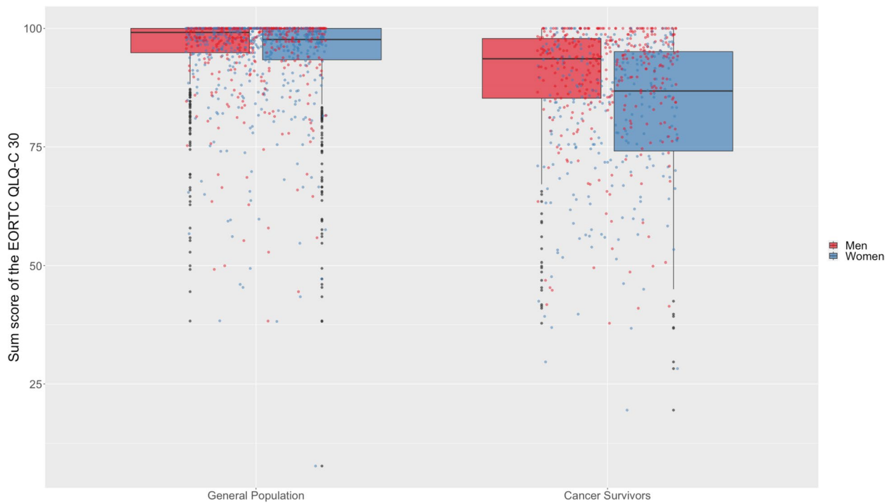
Fig. 2 Plot of participants' quality of life reports

Interaction between sex/gender and group (general population vs. long-term childhood cancer survivors). The sum score of the EORTC QLQ-C30 includes the functional and symptom scales (excluding financial difficulties), with higher scores indicating better quality of life (range 0–100)