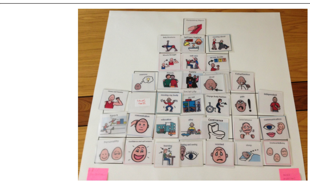
Fig. 3 Completed prioritisation grid from one group

We examined whether existing multidimensional generic PROMs identified in our systematic review [15] measure these health outcomes. Whilst available