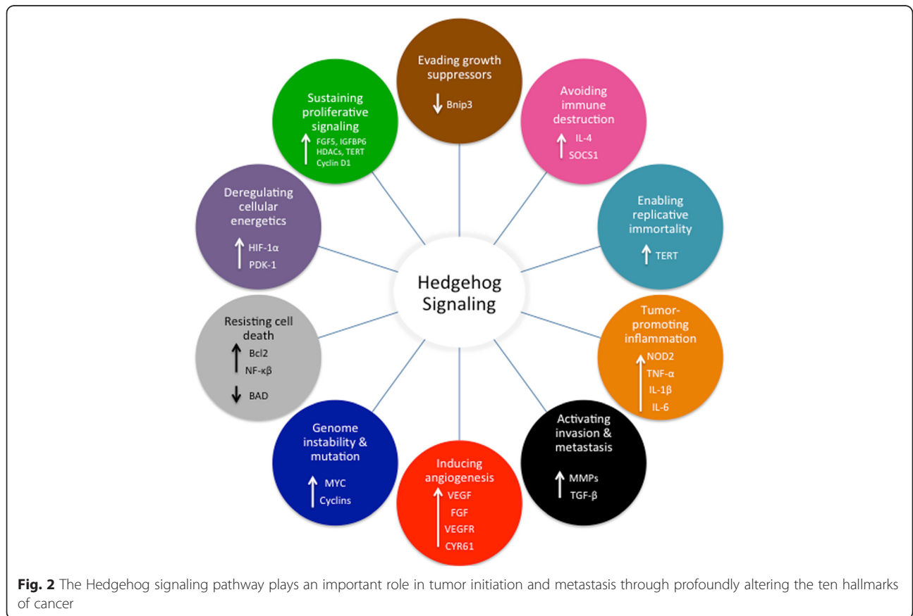
Fig. 2 The Hedgehog signaling pathway plays an important role in tumor initiation and metastasis through profoundly altering the ten hallmarks of cancer

The most pronounced characteristic of cancer is the unrestricted proliferation of cells. As the main function of Hh signaling is to promote fetal development and patterning, it is expected that signaling through the pathway would upregulate genes involved in cellular proliferation and survival, a function that tumors manipulate. Not only does Hh signaling promote the over-proliferation of cancer cells themselves, but it