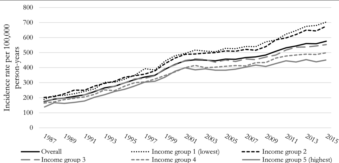
Fig. 1 Annual atrial fibrillation (AF) (including atrial flutter) incidence rate per 100,000 person-years from 1987 to 2015 in Denmark, overall and stratified by income groups

In the subset of the cohort (2011–2015), used in the geographical analyses at municipality level, 3,736,883 individuals (16,850,154 person-years) were included whereof 93,434 had an incident AF (IR = 554.1 per 100,000 person-years). Baseline characteristics at inclusion (Table 1) shows that most of the individuals were 30–59 years (68%) and married or living with a partner (67%). Nearly half had 10–12 years education (45%) while the individuals were close to evenly distributed in the five income groups (categorization of income was based on quintiles). The AF IR was 616.8 and 495.8 per 100,000 person-years among men and women, respectively (Table 1), and increased from 111.1 to 3,346.3 per