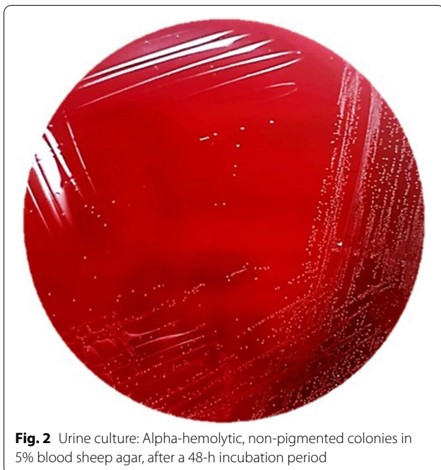
Fig. 2 Urine culture: Alpha-hemolytic, non-pigmented colonies in 5% blood sheep agar, after a 48-h incubation period

Facklamia species are Gram-positive, catalase-negative, facultative anaerobic cocci, and its identification with traditional microbiologic tests can represent a challenge. Depending on species and growth conditions, they