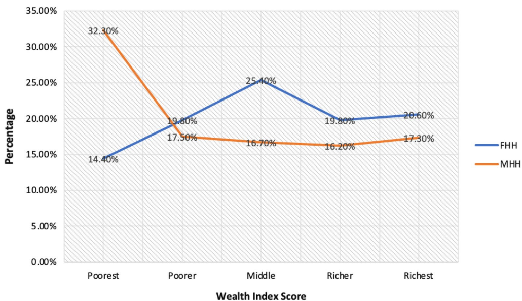
Fig. 1 A comparison of wealth across female-headed and male-headed households, 2019 GMIS