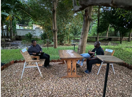
Fig. 4 Picture of the first mosquito-free zone established at Ifakara Health Institute in January 2020. The chairs have transfluthrin-treated hessian mats underneath, but are layered with plastic sheeting to prevent rainfall and user contact

transfluthrin-treated coils could protect non-users within 20 m radius. More recently, Mwanga et al. demonstrated that transfluthrin-treated ribbons fitted to the eave gaps of houses protected volunteers both inside and outside the houses [37].