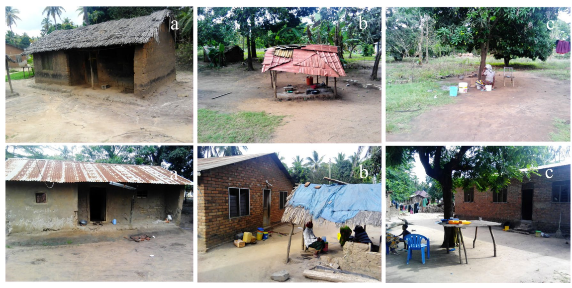
Fig. 3 Illustration of houses with veranda extension physically characterized during survey (a), houses with built-up peridomestic space away from the main house commonly used for cooking (b) and houses with non-built-up peridomestic space physically characterized as under the tree (c)

Findings on protective efficacy of the two interventions are summarized in Tables 3 and 4. Using two transfluthrin-treated chairs significantly reduced outdoorbiting An. arabiensis mosquitoes by 76% (Relative rate (RR) = 0.24, 95% confidence interval, CI 0.19-0.29, P < 0.001) and by 85% (RR=0.15, 95% CI 0.12-0.18, P<0.001) in dry and wet seasons, respectively. Using one transfluthrin-treated chair also significantly reduced An. arabiensis mosquitoes, in this case by 70% (RR=0.30, 95% CI 0.25–0.37, P < 0.001) and by 75% (RR=0.25, 95% CI 0.20–0.31, P < 0.001) in dry and wet seasons. When the densities of Culex mosquitoes were assessed, both the two-chair and one-chair interventions significantly reduced outdoor-biting, achieving 52% (RR = 0.48, CI 0.37-0.63, P<0.001) and 58% (RR=0.42, 95% CI 0.31-0.56, P<0.001) protection, in dry and wet seasons, respectively. In the wet season, both the two-chair and one-chair interventions significantly reduced outdoorbiting, achieving 51% (RR = 0.49, CI 0.43-0.56, P < 0.001)