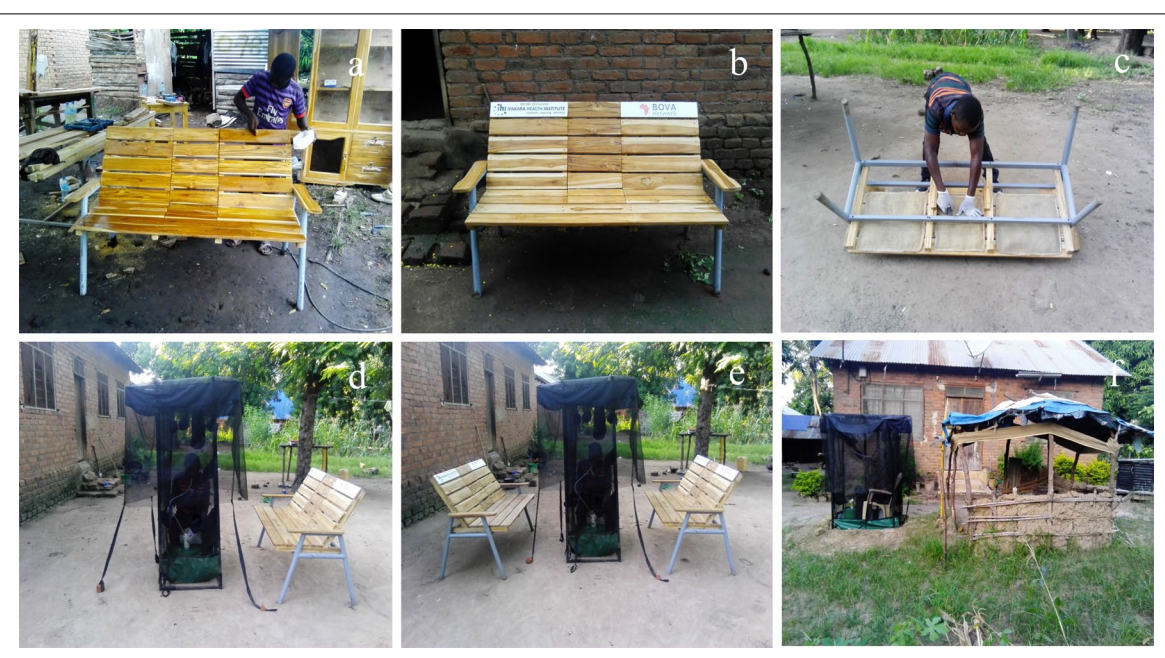
Fig. 2 Design and prototyping of the wooden chairs at the local carpentry ( a ), overview of the prototyped chair ( b ), fitting transfluthrin-treated hessian mat underneath the chair ( c ), one transfluthrin-treated chair with the DN-Mini trap positioned 0.5 m ( d ), two transfluthrin-treated chairs with DN-Mini trap installed 0.5 m ( e ); and outdoor kitchen fitted with transfluthrin-treated sisal ribbon with DM-Mini trap positioned 1.2 m ( f )

Masalu et al. Malar J (2020) 19:109 Page 4 of 13