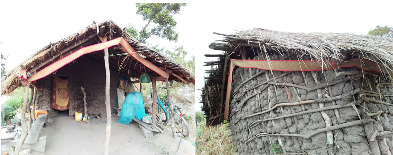
Fig. 3 Selected structures for evaluating the use of transfluthrin-treated eave ribbons installed along the eaves spaces of farm huts for preventing mosquito bites indoors and outdoors

Each night, indoor and outdoor mosquito collections were done between 18.00 and 07.00 h using CDC ® light traps (CDC-LT) [43] and carbon dioxide-baited BG ® malaria traps (BGM) [44, 45], respectively. Each morning, the collected mosquitoes were sorted by sex, and all