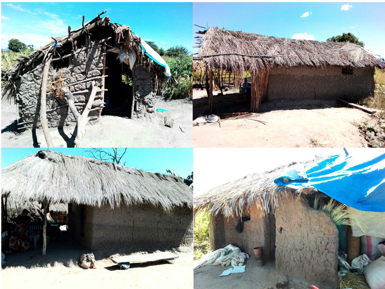
Fig. 1 Examples of makeshift housing structures that the migratory farmers use when they go to the farms in the distant river valleys

In rural southeastern Tanzania where subsistence rice cultivation is a common economic activity, families often relocate to their farms in distant river valleys for weeks or months (usually between January and June), to tend to their crops, only returning to their main residential homes at the end of the farming season. In most cases, parents bring with them their children below school age. While at the farms, these families usually dwell in temporary structures (Fig. 1), leaving them disproportionately more exposed to mosquito bites than the rest of the population [16]. In some of these structures, use of standard prevention tools, such as ITNs, is also compromised [16]. Affordable alternatives are therefore necessary to