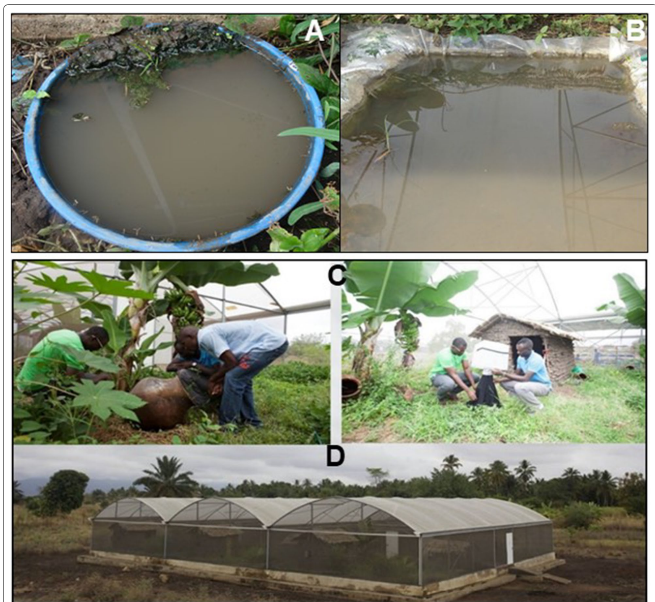
Fig. 1 Pictorial representation of aquatic habitats, a plastic basin (a) and ground depression (b), installed inside semi-field system chambers (d), where mosquito self-sustaining colonies were established. The chambers had vegetation, a mud hut and mosquito resting sites, and cattle were let in every evening for mosquito to blood-feed on. Monitoring was done with emergence traps (c)

All larvae in the aquatic habitats fed on naturally forming algae and other nutrients present in the habitats, without adding any larval food supplement. To ensure that the emerged mosquitoes had bloodmeal sources, two cows were introduced and tethered inside a separate