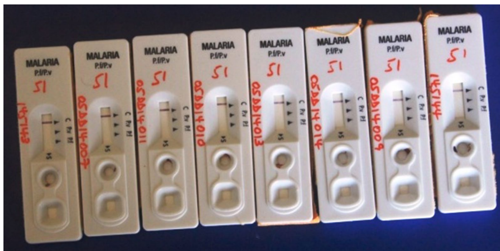
Fig. 2 Some of the false negative results of malaria RDTs

The joint assessment with the manufacturer of five P. falciparum patients yielded the following results. A known positive control, prepared at 2000 parasites/ \mu l, gave positive results when tested against all SD Bioline HRP2Pf/Pv RDTs whether they were retained with the manufacturer or those distributed to the field in Eritrea. However, the five malaria patients (all were microscopy confirmed P. falciparum -infected) could not be detected by all the RDTs, except with SD Pf/Pan type where the Pan-line band only turned positive to each of the specimens (Table 2). All the microscopically confirmed cases were also re-confirmed by PCR by SD at the manufacturing facility.