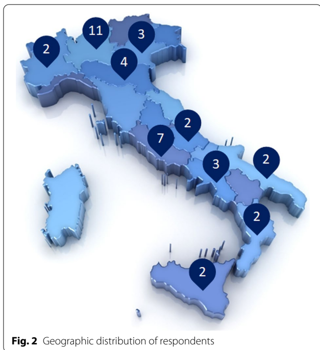
Table 2 Clinical experience and professional role of the respondents