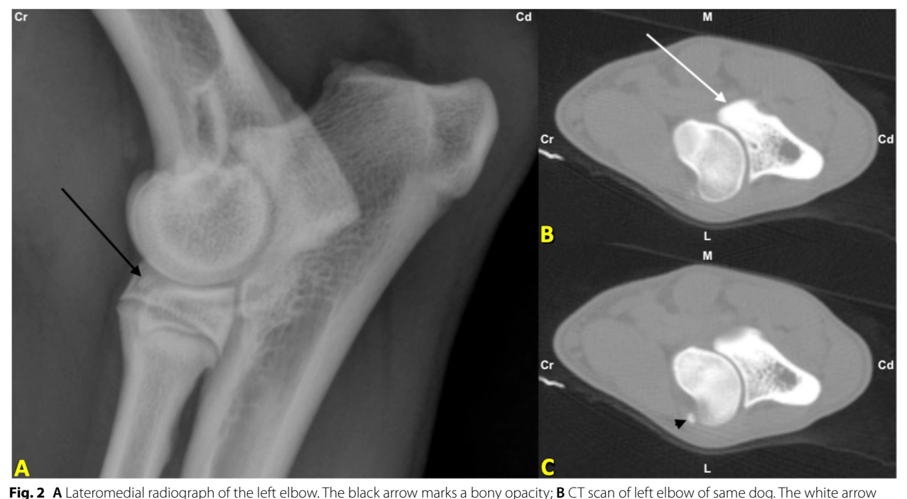
Fig. 2 A Lateromedial radiograph of the left elbow. The black arrow marks a bony opacity; B CT scan of left elbow of same dog. The white arrow marks the intact medial coronoid process; C CT scan of the left elbow of the same dog. The black arrowhead marks the sesamoid bone in the supinator muscle

reported. No average calculation was needed to present the CT scan's results, as the 3 observers found the same numbers of SSBs. An average number of the detected SSBs unilaterally and bilaterally on radiographs was calculated; 8.33 and 43.52% respectively.