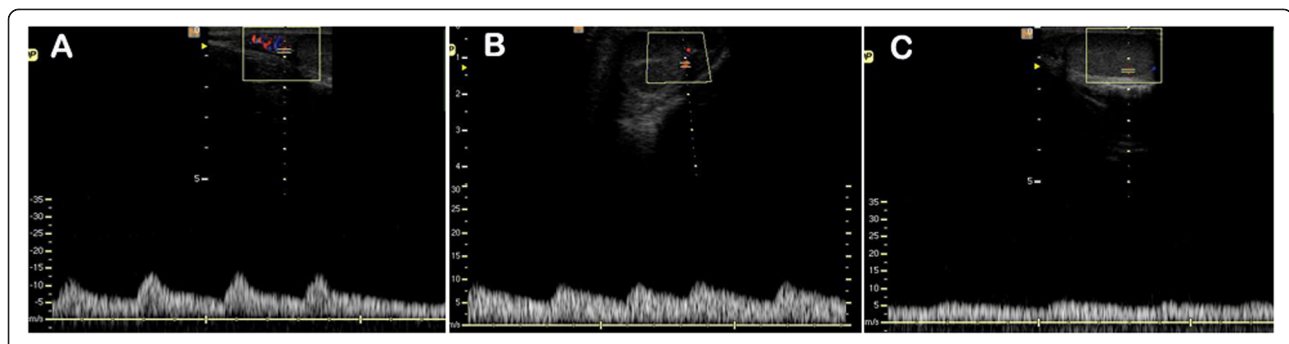
Figure 1 Typical Doppler ultrasound waveforms from the testicular artery of post-pubertal dogs. Images were recorded from (A) distal supra-testicular artery, (B) marginal artery, (C) intra-testicular artery.

provide a useful reference baseline particularly with respect to differences according to region and pubertal status.