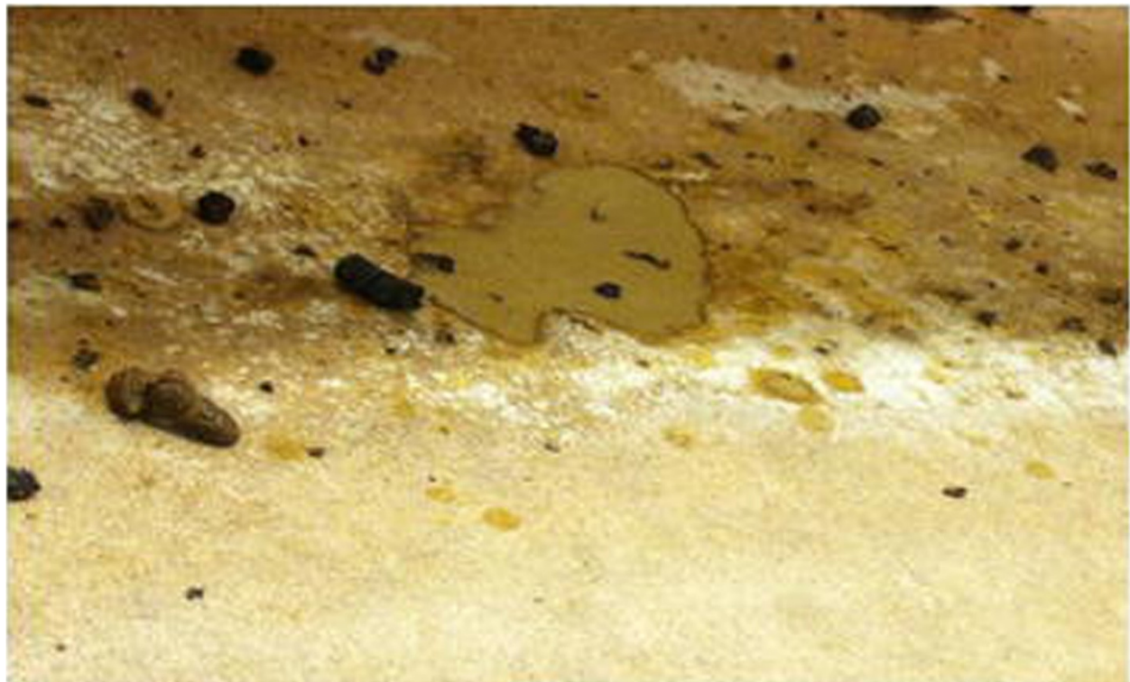
Figure 3 Diarrhea on floor below the positive control group pen. Following ingestion of feed spiked with stock PEDV, piglets in the Positive control group developed clinical signs of PED 2 days post-ingestion. This photo illustrates watery diarrhea observed below the pen floor housing these piglets.

The in vivo phase of the study was conducted from January 17–24 and results are summarized in Table 2. Prior to initiation of the in vivo phase of the study, all