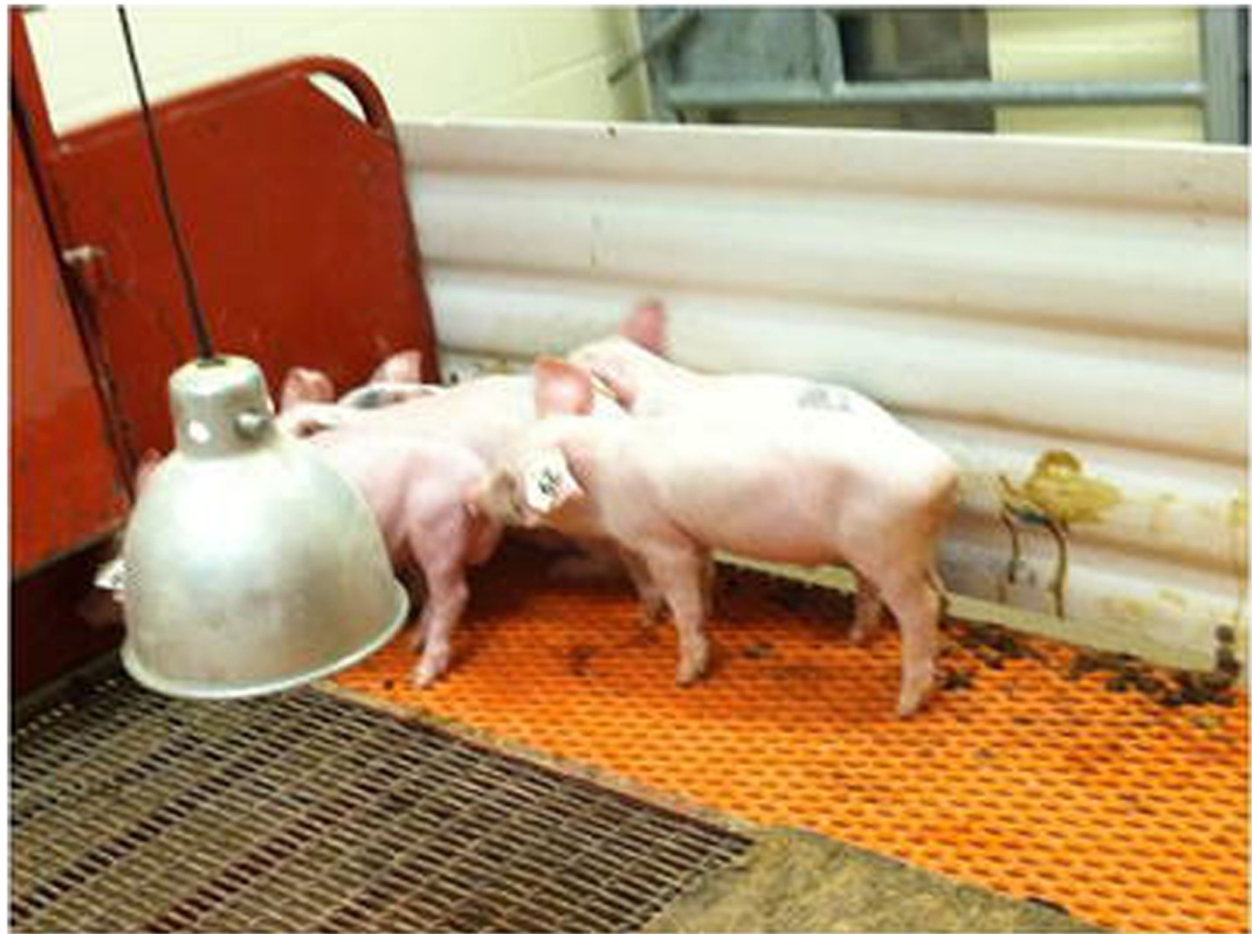
Figure 1 PED in treatment group. Depicted in this figure are clinically affected piglets from the Treatment group on day 6 post-ingestion of PEDV-contaminated feed. Piglets demonstrated loss of condition, rough hair coats, along with clinical signs of PED (diarrhea and vomiting). Evidence of diarrhea is visible on the pen wall behind the pigs. Prior to necropsy, rectal swabs from all 5 piglets were PEDV-positive as detected by PCR.

* = 2 pigs detected as positive on rectal swabs.