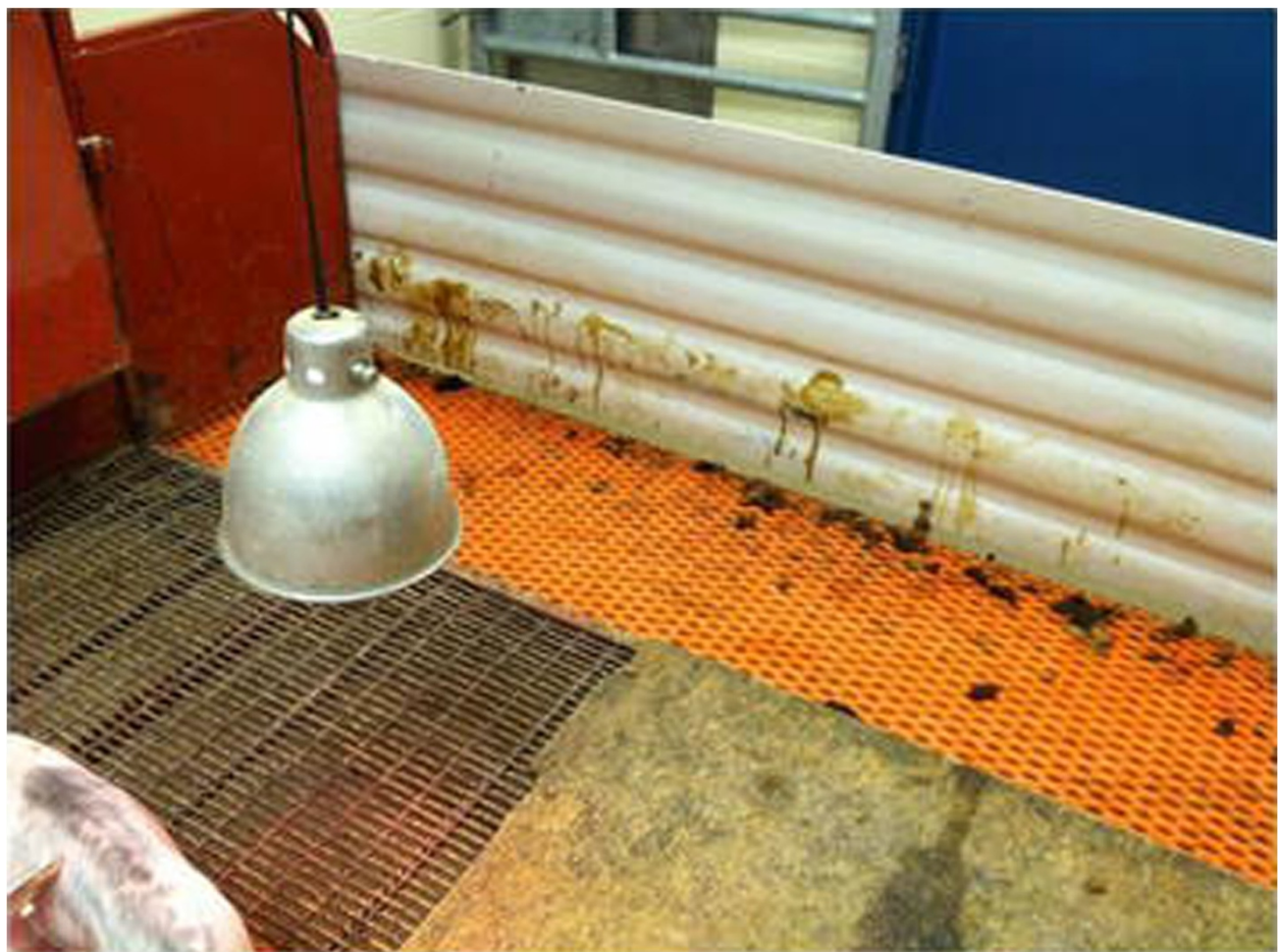
Figure 2 Diarrhea in the treatment group pen. This figure illustrates fecal staining on the wall of the pen housing the Treatment group piglets. This image was taken on day 6 post-ingestion of PEDV-positive feed.

For select samples, it was planned to conduct nucleic acid sequencing of the PEDV S1 gene. Specifically, fragments of the S1 domain of the spike gene were amplified from extracted RNA. Primers 1: (5'- ATGARGTCTTT AAYTACTTCTGG-3'), 2: (5'-CATCCTCACCWGCA CTAGTAAC-3'), 3: (5'- GTTGTGCTATGCAATATGT TTAY-3'), 4: (5'-TGAAATTAATTGTGACAGCATC-3'), 5: (5' -TTGTCATCACCAAGTAYGGTG -3'), 6: (5'- CT AAAAGACAGGTAATCATTAACAG- 3'), 7: (5'- CTG TGTTGACACTAGACAATTTAC- 3'), 8: (5'- CATACT AAAGTTGGTGGGAATAC- 3') were designed to anneal to conserved genomic regions. Incorporation of degenerate bases maximizes the ability of the PCR to amplify genetically divergent PEDV variants between the US and UK strains. Primer pair 1 and 2 obtained a PCR product size of 670 bp, primer pair 3 and 4 obtained a PCR product size of 678 bp, primer pair 5 and 6 obtained a PCR