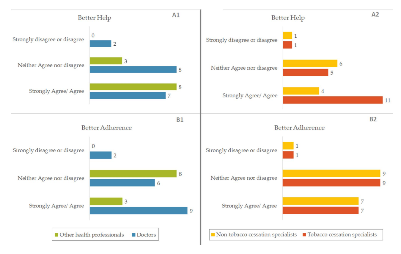
Fig. 4 Answers to the questions « Giving products free of charge allowed me to provide a better help than with a simple prescription ( A ) » and « Giving products free of charge allowed patients to have a better adherence to treatment ( B ) », according to profession or specialty of health professionals participating in the STOP RCT.(France, 2023)

Overall, the study took approximately 10 min to present the aims 30 min to explain the procedures in addition to a standard appointment time, 30 min of time dedicated to administrative procedures and data colelction (Table 3). Time is the most frequent constraint to study participation reported by participating health professionals. This was in fact mentioned in almost half of the open-ended comments (31 out of 81).