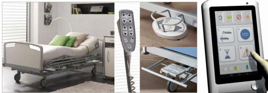
Fig. 4 User interfaces in smart beds are multiple, robust and dedicated to the patient and/or caregiver. Integration of new technologies, ergonomics and graphical interfaces allows for improved control over a broader range of functions. Left: Olympia Hospital bed, developed and manufactured by Haelvoet [46]. Right: example of a graphical-user interface designed for the control of a new generation of medical beds [47].

Finally, patient-motion assistance is another field of research that is valued for the care of the older and disabled patients, with research solutions [29], as well as consumer-ready devices incorporating such features, so that the device supports patient motion, instead of replacing it.