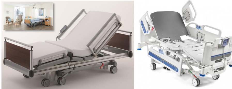
Fig. 2 Aesthetic and design customizations stand out in state-of-art medical beds, serving a purpose of adaptation to different environments. Left: residential-inspired, long-term care (Völker LTC Vis-à-vis bed) [43]; Right: cardiac and progressive-care for hospital ward (Malvestio Sigma PCU Electric Bed Scale System) [44]. Permission for use of images granted by Völker and Malvestio

risk-management strategies as a consolidated reference among five scenarios for medical beds (from hospital to nursing and home environments) [12], was first amended in 2015 [14], and falls within the updated scope of IEC 60601 [15].