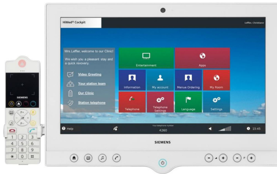
Fig. 5 Interactive patient-care systems integrate technology, information and communications into the healthcare environment [38].

an even greater impact. Accessibility-enabled smart medical beds have the potential of becoming the center of new, comprehensive and patient-conscious healthcare environments.