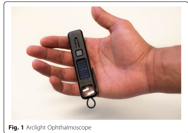
Fig. 1 Arclight Ophthalmoscope

We used a mixed methods design, primarily in the form of a method comparison study supported by a qualitative