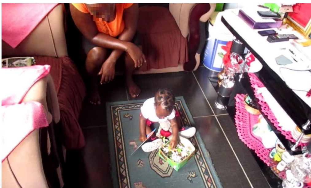
Fig. 3 PHOTOVOICE STORY TWO: neighbour cares for the baby

'So that is why I decided to ask this lady [neighbour] to look after my baby. Even though she is unemployed but she takes good care of herself and she takes good care of my baby. If it happens that my child gets sick; I know that I have left money behind which she will use to take the baby to the clinic. She does not have to worry about how she will take the baby to the clinic and what will happen to the other babies [like at the crèche]' (SL01, photovoice gp 1)