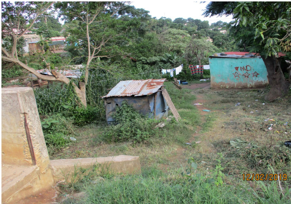
Fig. 5 PHOTOVOICE STORY FOUR: where my child is cared for

'Ok, this is where my child is cared for....As you can see this is where I live. My house is built with mud and it is a bushy area...the worst part of living here is that the toilet that we use is not clean. The toilet is just a covered hole. It is not good. The child is being cared for in a place that ... stinks. It just stinks. The entire environment where my child is cared for is not clean.' (SM12, Photovoice gp1)