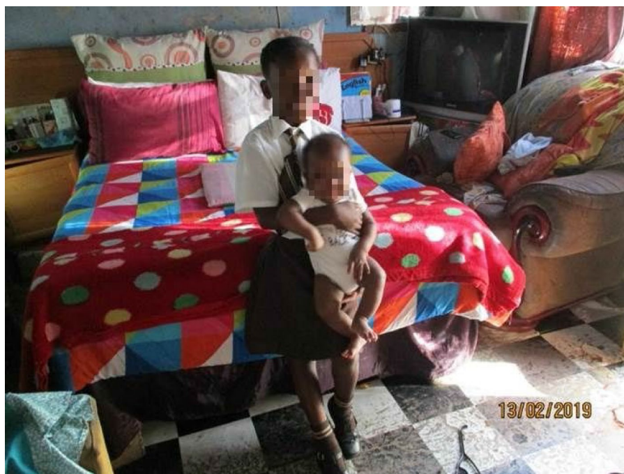
Fig. 2 PHOTOVOICE STORY ONE: sibling looks after the baby

'My first born [child] does help me out by looking after the baby when I am selling because I sell stuff for a living. She looks after the baby when I perhaps have to collect water from our neighbour's house since our water pipe has burst; my first born looks after the baby. She does get angry at times because she is still a kid and she wants to go and play but she is very helpful... My first born plays a very important role' (SM12, Photovoice Gp1)