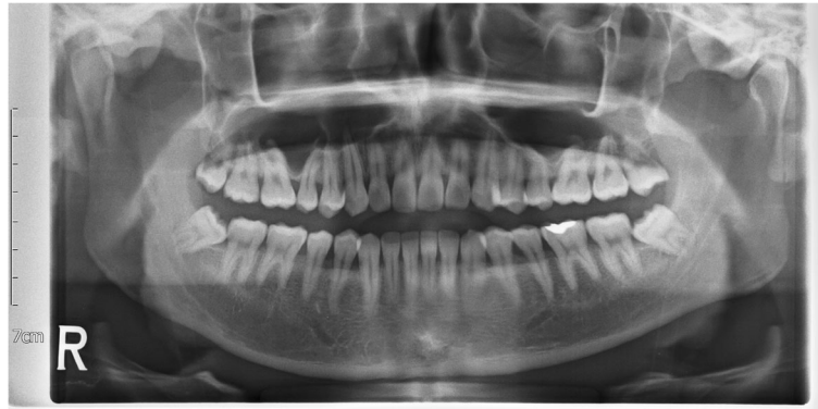
Fig. 1 Pre-operative panoramic radiograph showing impacted bilateral mandibular third molars with same Pell-Gregory and Winter classification

Ethicon Inc., Johnson and Johnson, New Brunswick, NJ, USA. Approximately one to three single sutures were used for the envelope flap distal to the second molar, followed by interdental sutures between the first and second molars. In cases where the retention of collagen sponge was considered unstable, crisscross suturing was performed. The participants of this study were patients that satisfied the Pell-Gregory classification and Winter classification and identical suturing technique was used on both sides of each patient. All patients were prescribed antibiotics (Huons Amoxicillin Cap. 500 mg tid , Huons, Seoul, Korea), analgesics (Soleton Tab. 80 mg tid , CJ healthcare, Seoul, Korea), and antacid (Famotidine Tab. 20 mg bid , Nelson, Seoul, Korea) for 7 days following the surgery and were given 0.12% chlorhexidine gluconate mouthwash to use every 12 h for 7 days. Patients visited the clinic at 1 week (for stitch out) (T1), 2 weeks (T2), and 14 weeks (T3) post-operatively for follow-up. Panoramic radiographs were taken post-operatively at 1, 2, and 14 weeks.