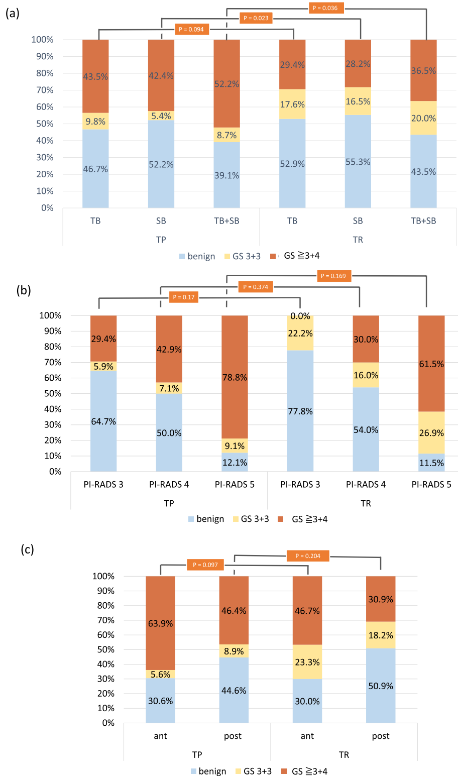
Fig. 2 Comparison of the cancer detection rate between transperineal software fusion biopsy and transrectal cognitive biopsy stratified by a TB or SB, b PI-RADS score, and c target lesion location. Each p value indicated the comparison of the detection rates for csPC between transperineal biopsy and transrectal biopsy. ant, anterior lesion; csPC, clinically significant prostate cancer; GS, Gleason score; PI-RADS, Prostate Imaging-Reporting and Data System; post, posterior lesion; SB, systematic biopsy; TB, targeted biopsy; TR, transrectal biopsy; TP, transperineal biopsy