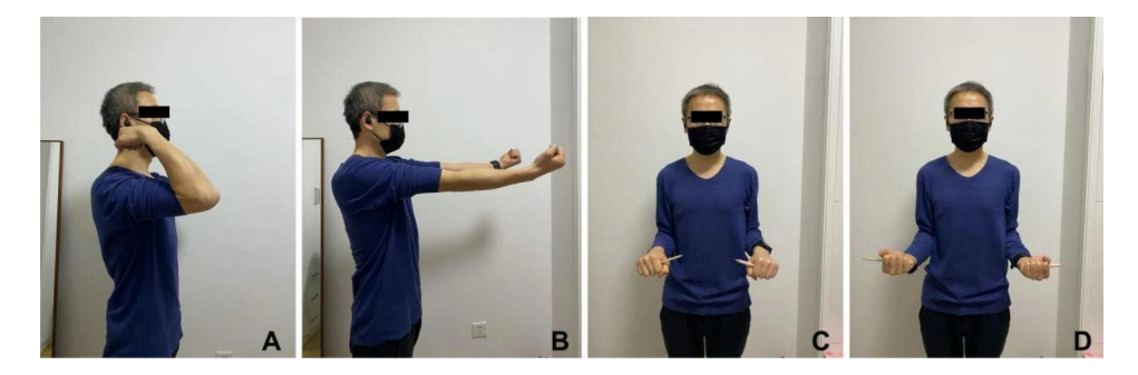
Fig. 4 The functional images of a 41-year-old man at one year after surgery in Group (A) A. flexion; (B) extension; (C) pronation; (D) supination. Ipsilateral side (right), contralateral side (left)