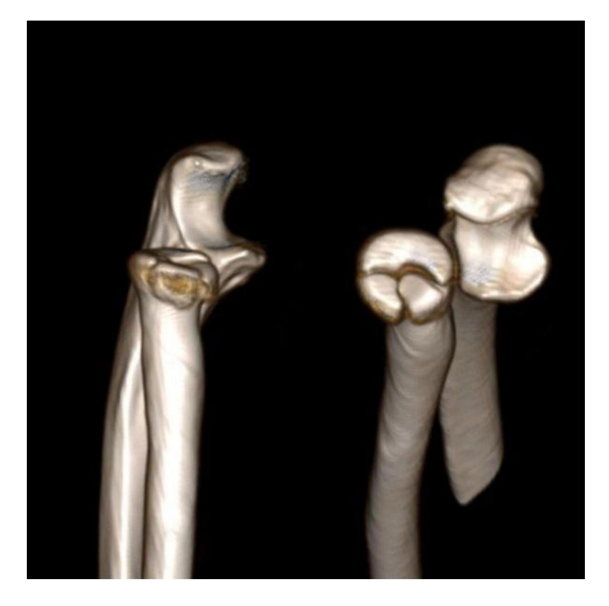
Fig. 1 Three-dimensional computerized tomography reconstruction of the radial head fracture of one included case (Mason III)

that are amenable to open reduction and internal fixation (ORIF) [3]. However, Mulders et al. reported that nonoperatively treated adults with an isolated Mason II radial head fracture had similar functional results after one year compared to operatively treated patients [4]. For Mason III, the ORIF or arthroplasty is mostly recommended [5]. For the materials of internal fixation, the plates are widely used. However, enlarged incision easily damages the deep branch of the radial nerve during the placement of plates. And the plate is hard to be placed at the ideal position (i.e. the "safe zone" of the radial head) [6], which results in a high incidence of hardware failure and a decreased range of motion [7]. Headless compression cannulated screws have shown advantages in the fixation of simple intra-articular fracture fragment, but we found that it is challenging to fix comminuted or thin fracture fragment with screws, in which the screws are hard to maintain the mini-fragment stability or increase the incidence of iatrogenic fracture.