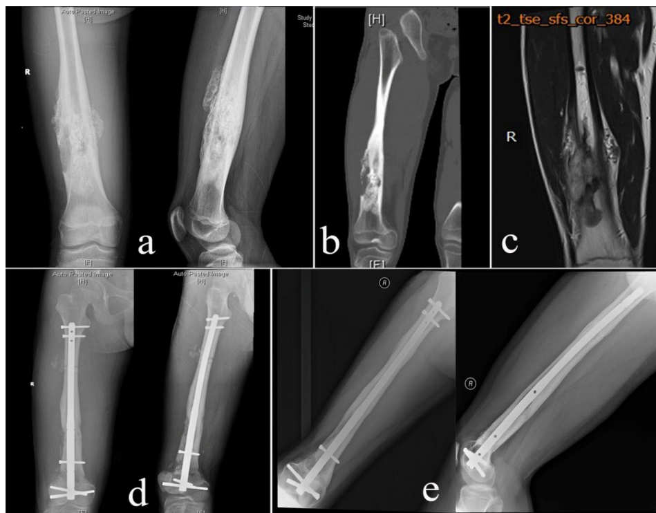
Fig. 2 A 16-year-old male with osteosarcoma involving the diaphysis of the right femur (case 24). (a, b and c) X-ray, CT and T2-weighted MRI (TR 3000.0ms, TE 98.0ms) showed the tumor involving the diaphysis of the right femur. d Postoperative X-rays after intercalary resection and recycling autograft reconstruction with intramedullary nail fixation. e X-ray at 10 months after reimplantation showing union at both osteotomy sites.)

only had slight limb pain and could walk on canes. No additional revision surgery was performed.