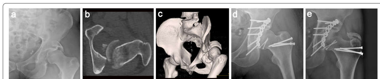
Fig. 2 A 49-year-old man (a-e) with a fracture of the left femoral head (Pipkin type IV) and of the posterior wall of the left acetabulum, treated by ORIF through Gibson approach and surgical hip dislocation with Ganz trochanteric flip osteotomy. The preoperative AP radiograph, axial CT and CT 3-D reconstruction after injury (a-c). Post-operative (d) and final follow-up radiographs (e)