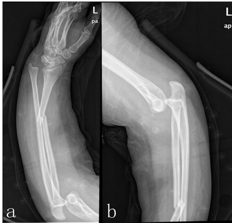
Fig. 1 X-ray of the left forearm showing both Galeazzi fracture and elbow dislocation. The fracture of radial shaft at the junction of middle and distal thirds, dorsal dislocation of the ulnar head (a), posterolateral dislocation of the elbow(b)

confirmed the elbow to be in joint and tested stability. After that, the patient underwent an open reduction and internal fixation of the radial fracture using a standard palmar approach of Henry [11]. A seven-hole 3.5-mm locking compression plate was used to stabilize the