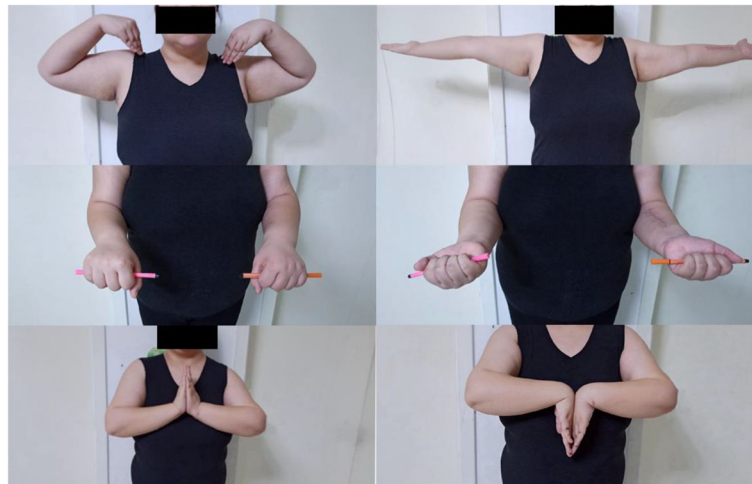
Fig. 4 The range of motion at the 12 month follow-up

with the body weight of the patient acting as a driving force resulting in Galeazzi fracture, elbow dislocation, and radial head fracture [9]. Regarding the Galeazzi fracture in adults, a much greater number of reported ulna-dorsal type than apex-palmar type fractures has been reported [17]. However, according to previous publications (Table 1), the apex-palmar type combined with elbow dislocation occurred in 4 cases, and the apex-palmar type Galeazzi fracture might be more likely than apex-dorsal type to cause “floating ulna” injury. All the patients had successful