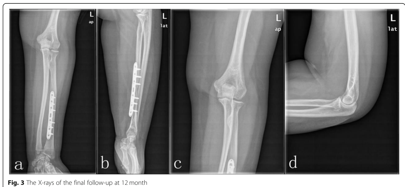
Fig. 3 The X-rays of the final follow-up at 12 month