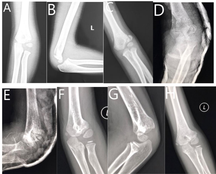
Fig. 2 Six-year-old boy of left delayed lateral condylar fracture treated with BP. a AP view of elbow joint at the time of injury. b Lateral view of elbow joint at the time of injury. c AP view of elbow joint at 6th week follow-up after initial injury. d AP view of elbow joint after surgery. e Lateral view of elbow joint after surgery. f AP view of elbow joint at 16th month follow-up after surgery. g Lateral view of elbow joint at 16th month follow-up after surgery. h AP view of elbow joint at 25th month follow-up after surgery

(13/26, 50%) in the BP group. The incidence of lateral prominence was (5/17, 29.4%) in KW and (7/26, 26.9%) in the BP group. Furthermore, the incidence of implant prominence was higher in KW (12/17, 70.6%) than BP (0) ( P < 0.001 ).