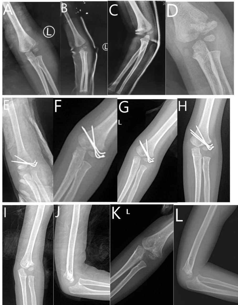
Fig. 1 Three year-old boy of left delayed LCF treated with ORIF. a AP view of elbow at injury. b AP view of elbow 2 weeks after injury. c Lateral view of elbow 2 weeks after injury. d AP view of elbow 5 weeks after injury. e AP view of elbow after surgery. f AP view of elbow at 5th week follow-up. g AP view of elbow at 2nd month follow-up. h AP view of elbow at 4th month follow-up. i AP view of elbow at 9th month follow-up. j Lateral view of elbow at 9th month follow-up. k AP view of elbow at 25th month follow-up. l Lateral view of elbow at 25th month follow-up

statistically significant difference between the KW ( 52.3 \pm 10.2 , month) and the BP ( 56.1 \pm 10.7 , month), ( P = 0.258 ). There was no statistically significant difference between the two groups concerning other parameters such as sex, fracture side, and Song classification. But the duration from injury to surgery is longer in the BP group ( 55.7 \pm 14.5 , day) than the KW group ( 45.1 \pm 15.5 , day), ( P = 0.034 ).