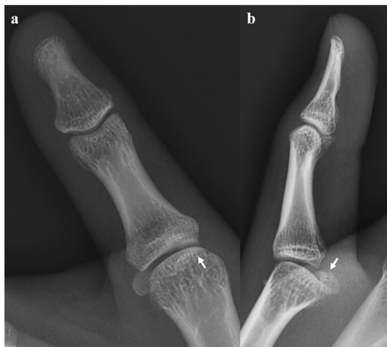
Fig. 1 Anteroposterior (a) and lateral (b) radiographs of the right thumb. The lateral radiograph shows a hyperextension posture of the metacarpal joint at approximately 30°. The abnormal location of the radial sesamoid (arrow) is difficult to recognize on radiographs because of bony overlaps

A locked thumb MP joint is rare. After mild hyperextension traumas of the MP joint, an inability to active or passive flexion is characteristic [3–5]. The cause of locking is unclear. Yamanaka et al. suggested that tearing of the proximal volar plate or accessory collateral ligament, which forms a constricting bundle over the distal metacarpal head, may cause locking [1]. Desai et al. reported entrapment of the sesamoid bone between the proximal