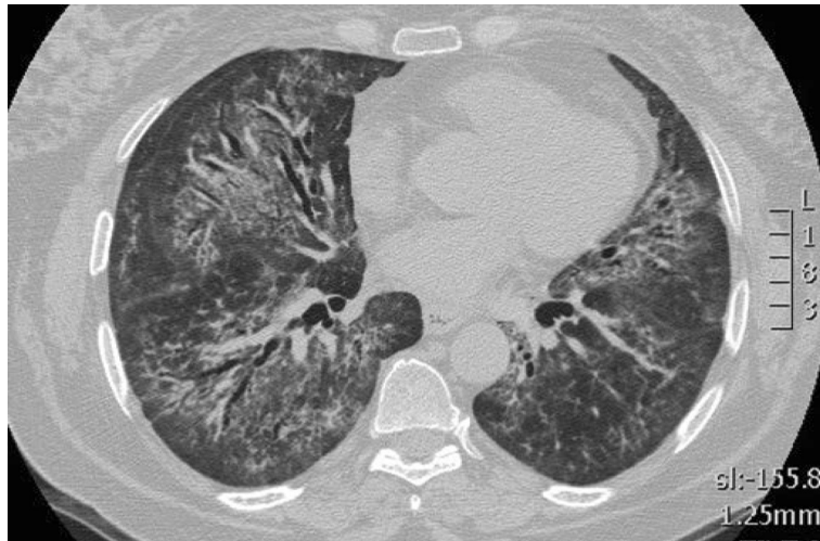
Fig. 1 CT scan of a 52 years old lady, affected by idiopathic NSIP. Bilateral, peribronchovascular ground glass attenuation, due to intralobular fibrotic changes. Traction bronchiectasis are present bilaterally surrounded by ground glass, "fibrotic" attenuation, mainly in the right middle lobe and in both lower lobes. No honeycombing is present. A relative subpleural sparing is also visible