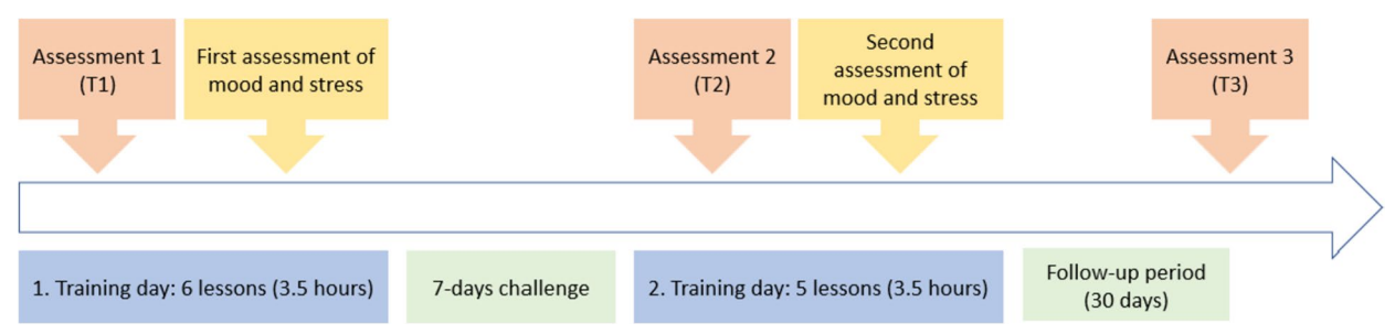
Fig. 1 Chronological order of PoET procedure