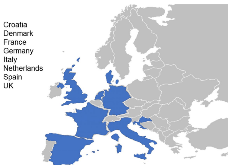
Fig. 1 Countries included in the LiverScreen project

Participants that fail to attend to visit 2 will be contacted by their primary care physician or nurse and referred again to the second visit. Participants will be